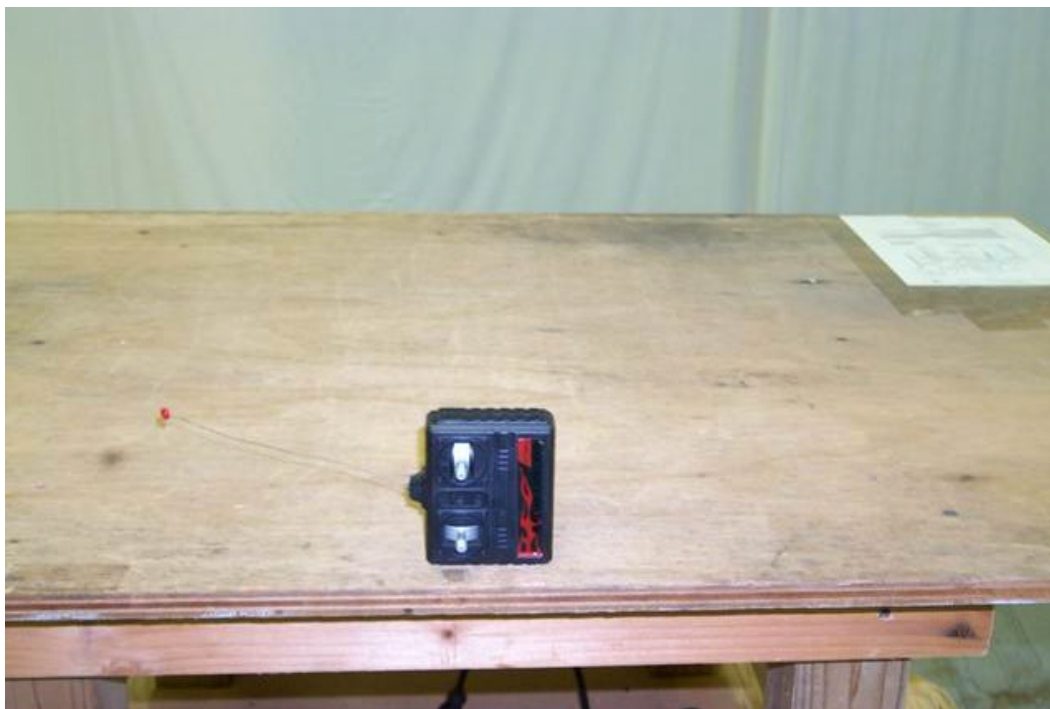
Figure 3.3 Radiated Test Setup, position 3