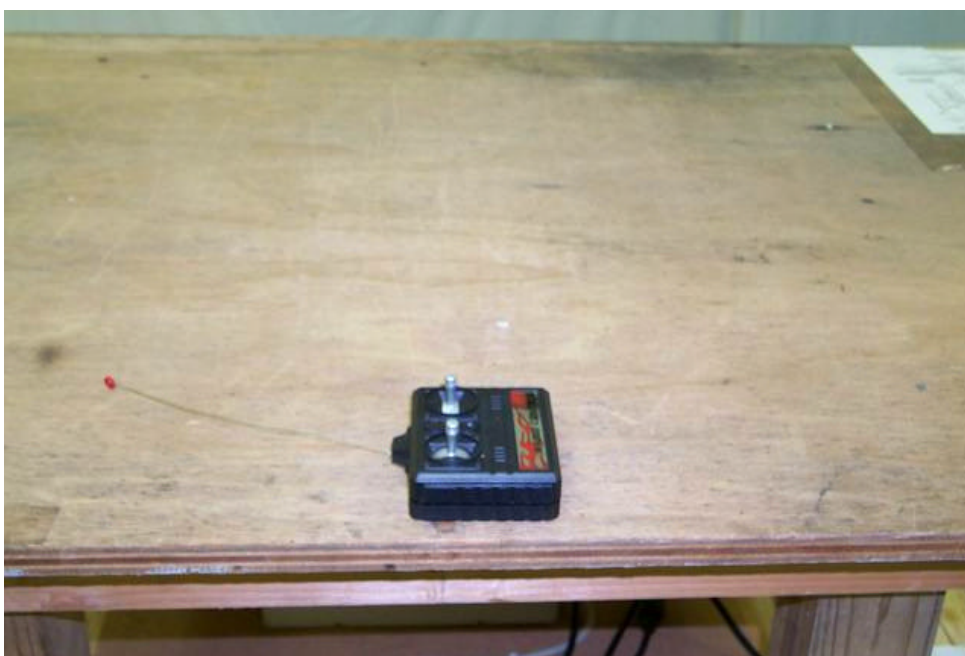
Figure 3.2 Radiated Test Setup, position 2