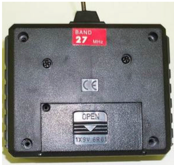
Figure 2.2 Location of the Label