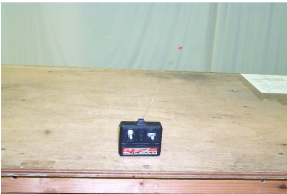
Figure 3.1 Radiated Test Setup, position 1