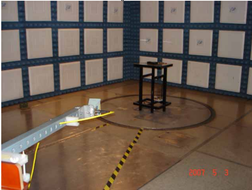
Test Set-up for Radiated Emissions – Horizontal Polarization