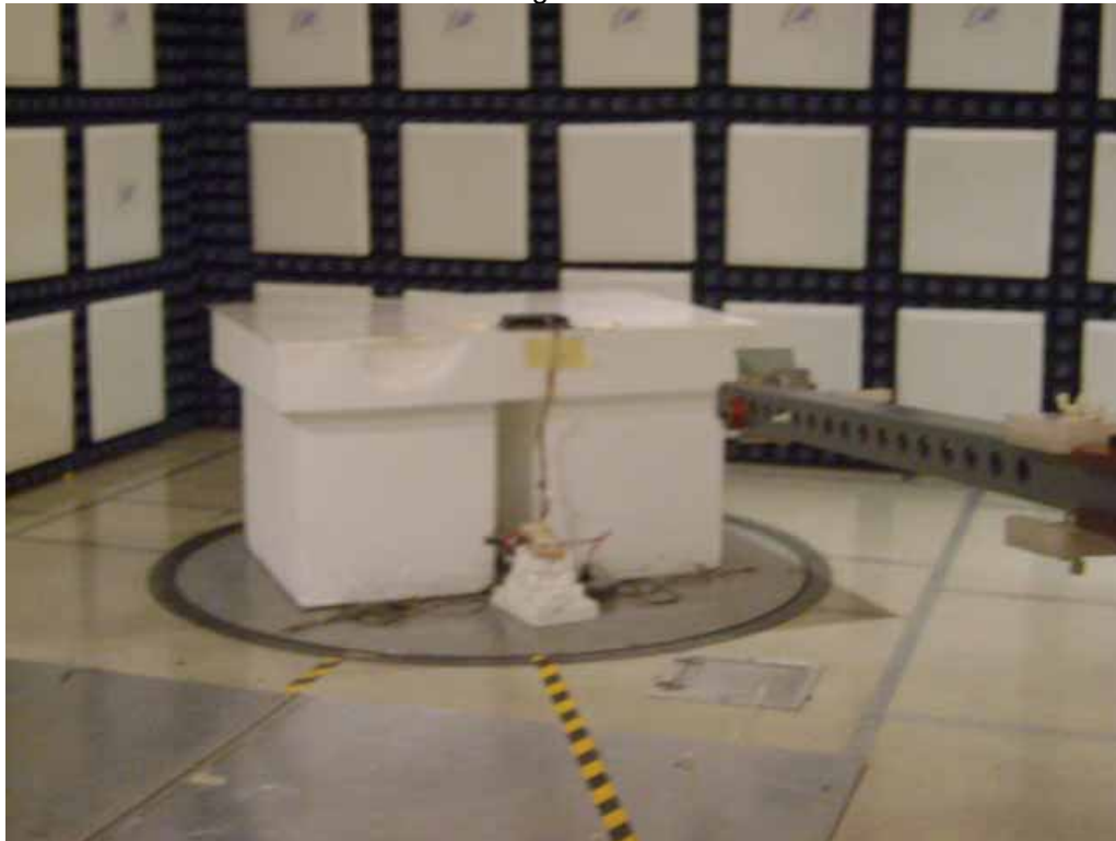
Test Setup for Radiated Emissions – 2GHz to 18GHz, Horizontal Polarization