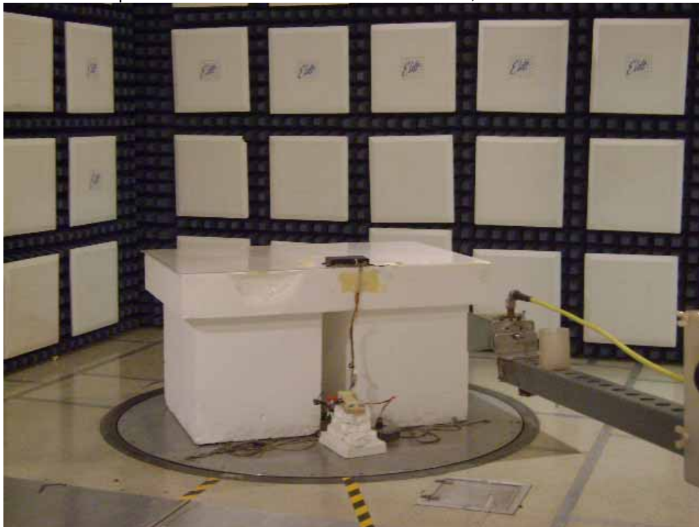
Test Setup for Radiated Emissions – 2GHz to 18GHz, Vertical Polarization