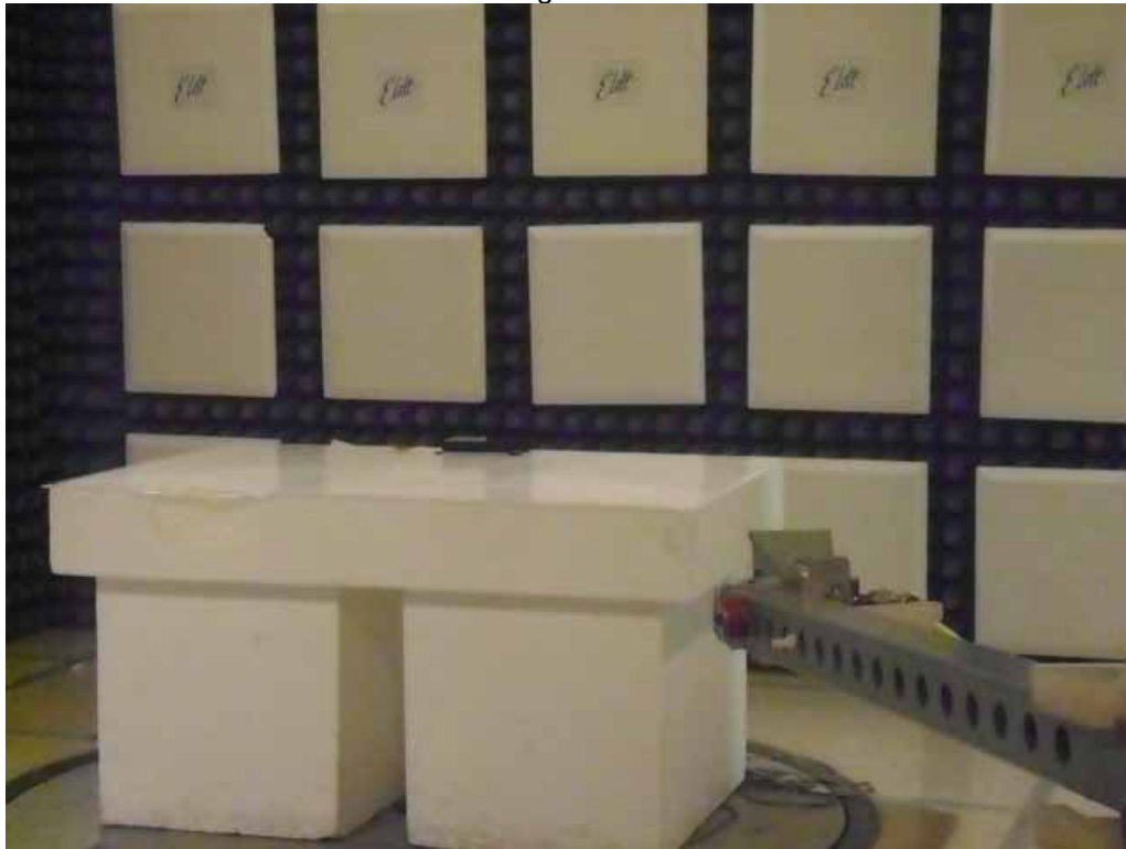
Test Setup for Radiated Emissions – 2GHz to 18GHz, Horizontal Polarization