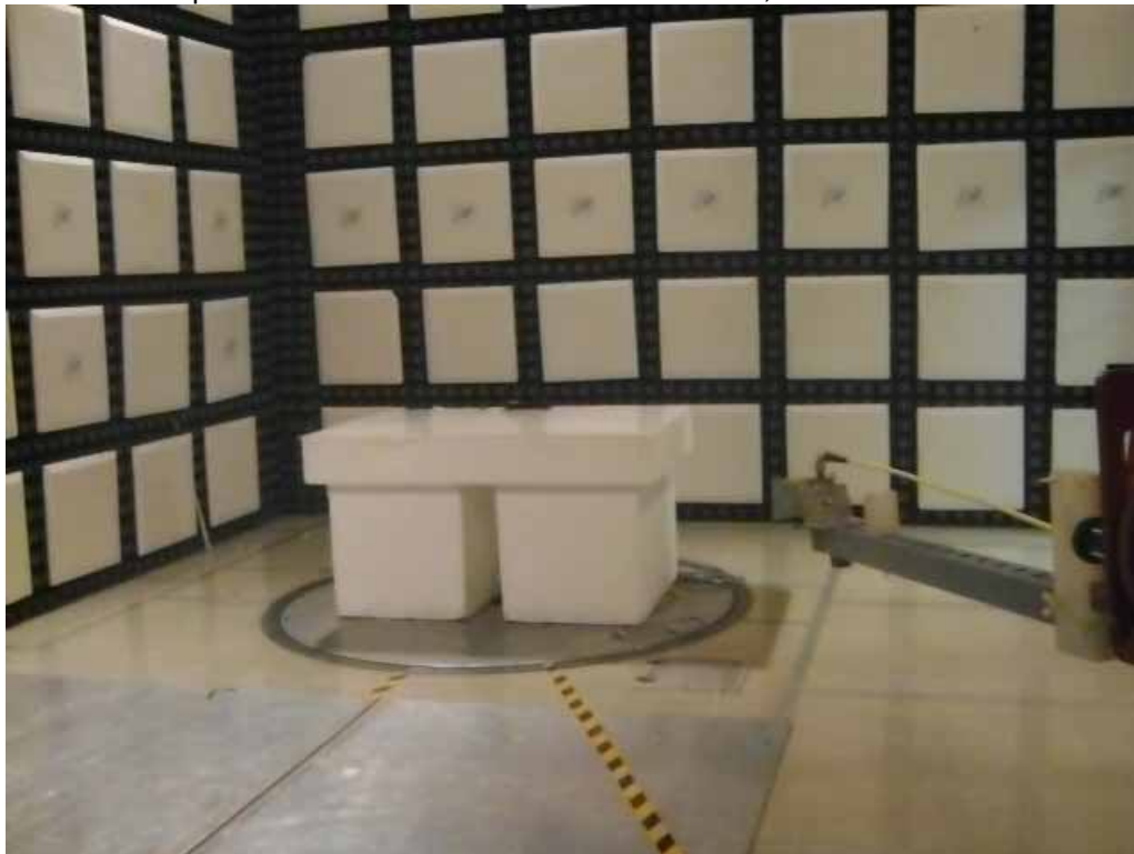
Test Setup for Radiated Emissions – 2GHz to 18GHz, Vertical Polarization