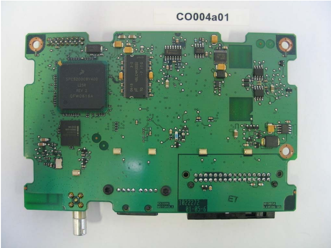
PCB – Bottom view