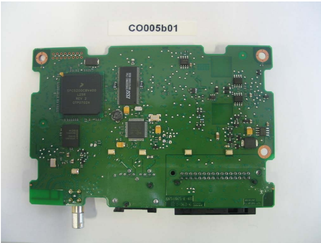
PCB – Bottom View