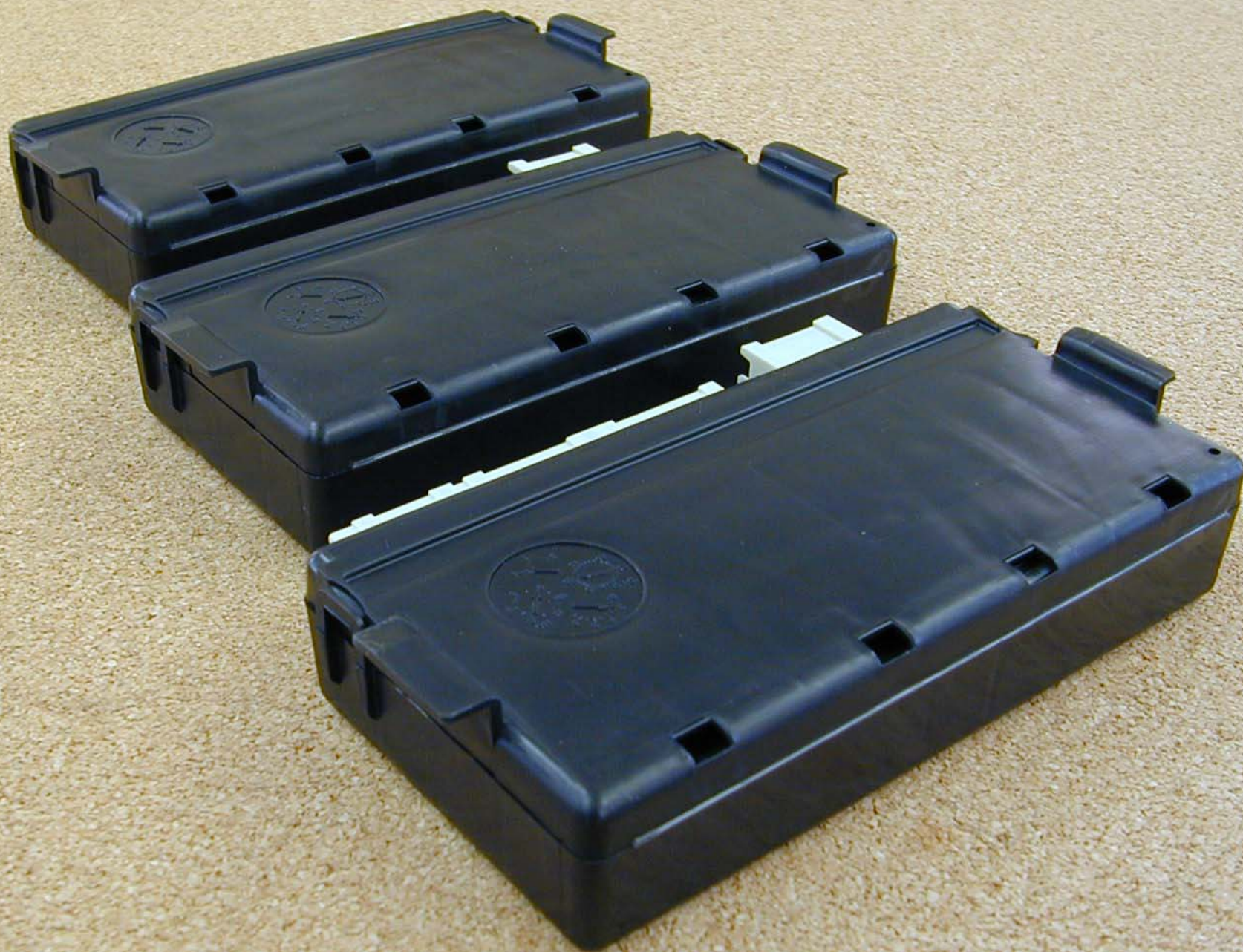
Cases from top to bottom, V6, L4 and SUV