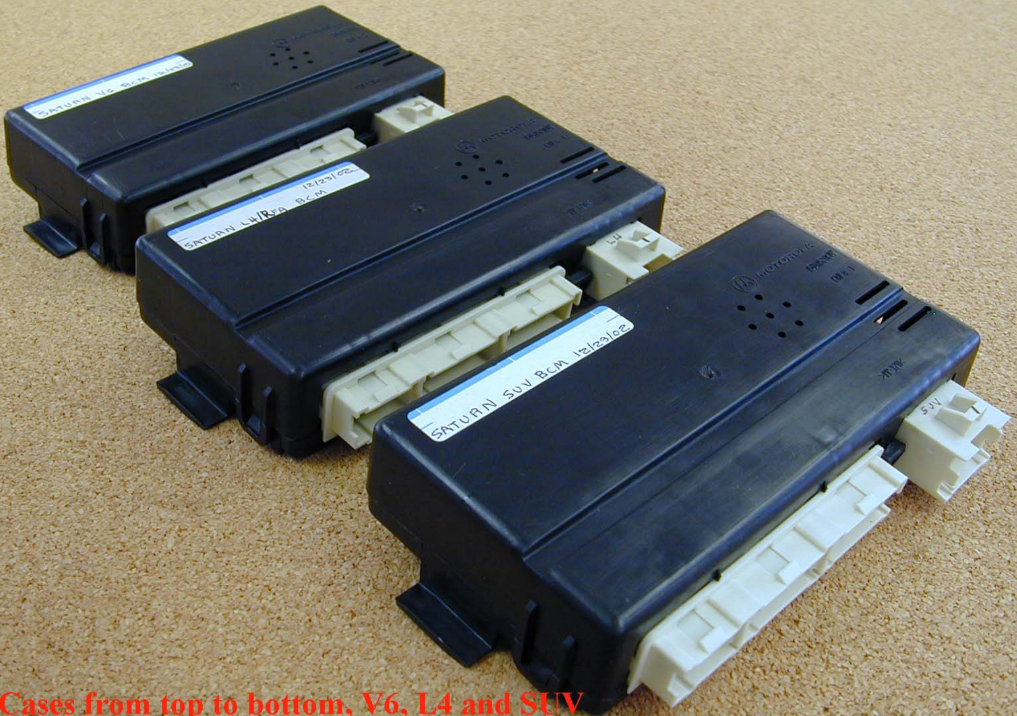
Cases from top to bottom, V6, L4 and SUV