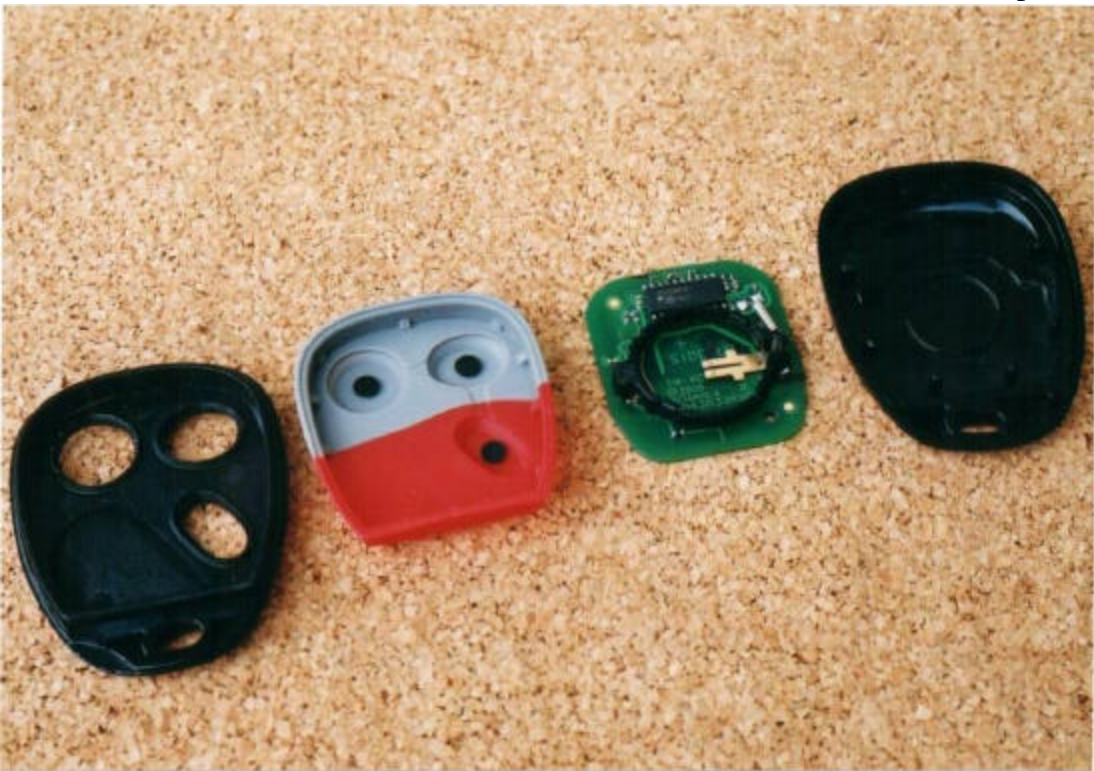
LHM011 Transmitter Open - Bottom