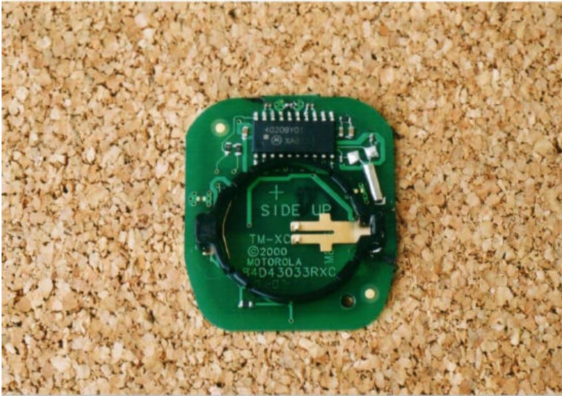
LHM011 Transmitter PCB - Top