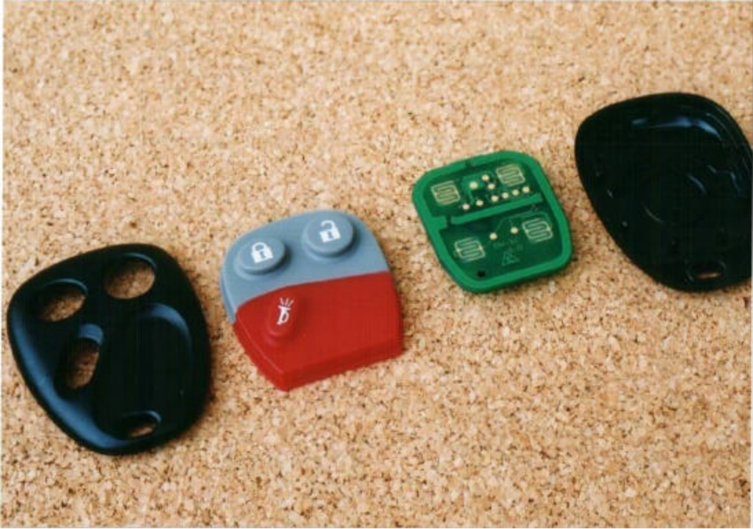
LHM011 Transmitter Open - Top