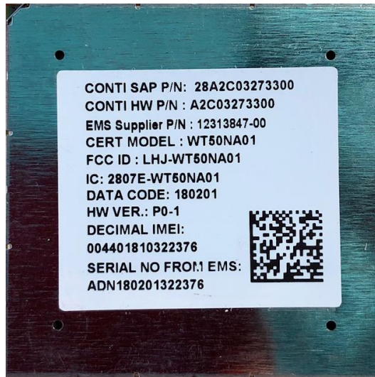
Fig. 1 WT50NA01 module top view