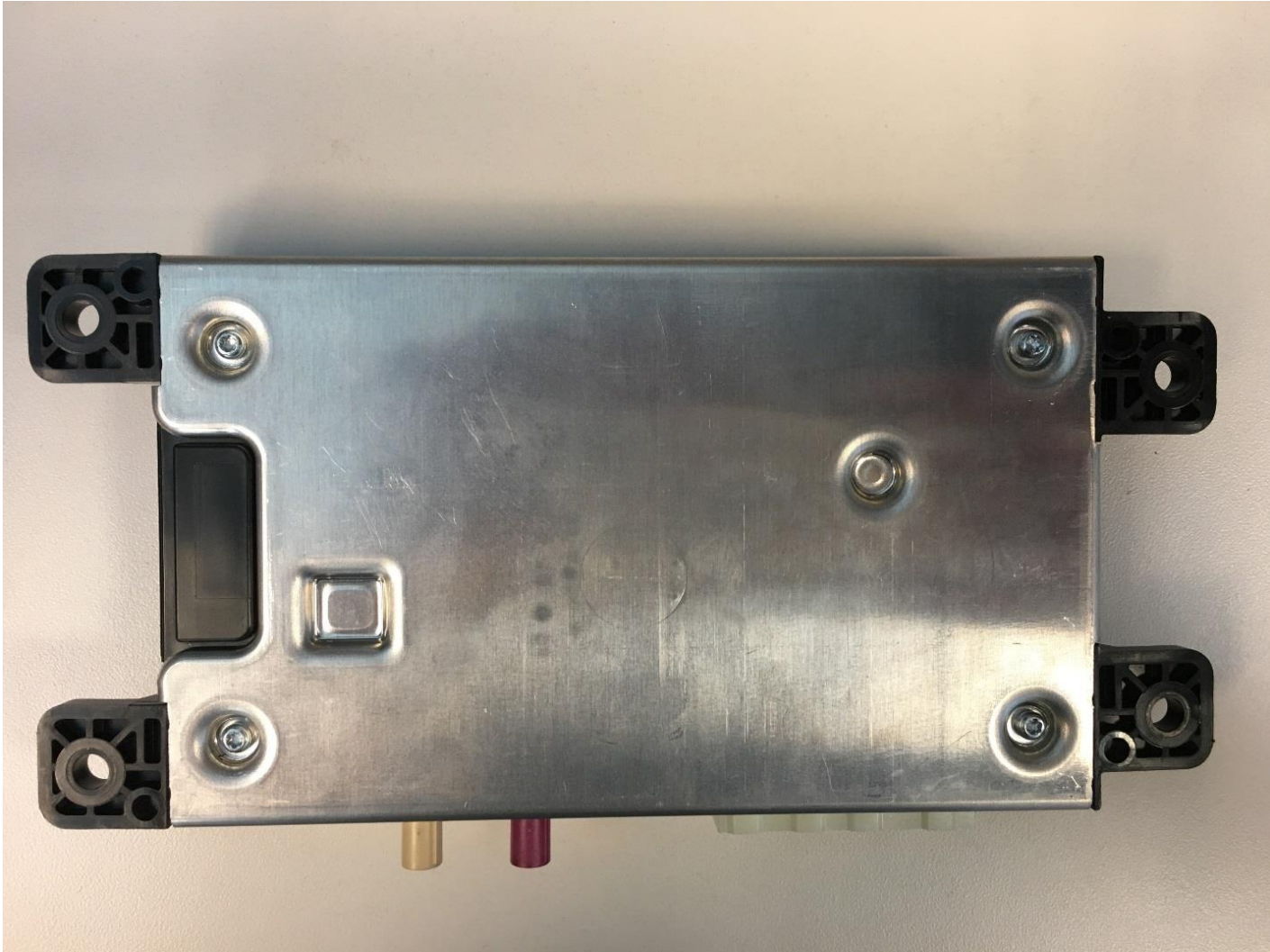
Fig. 5. FB40-ND1 Bottom side.