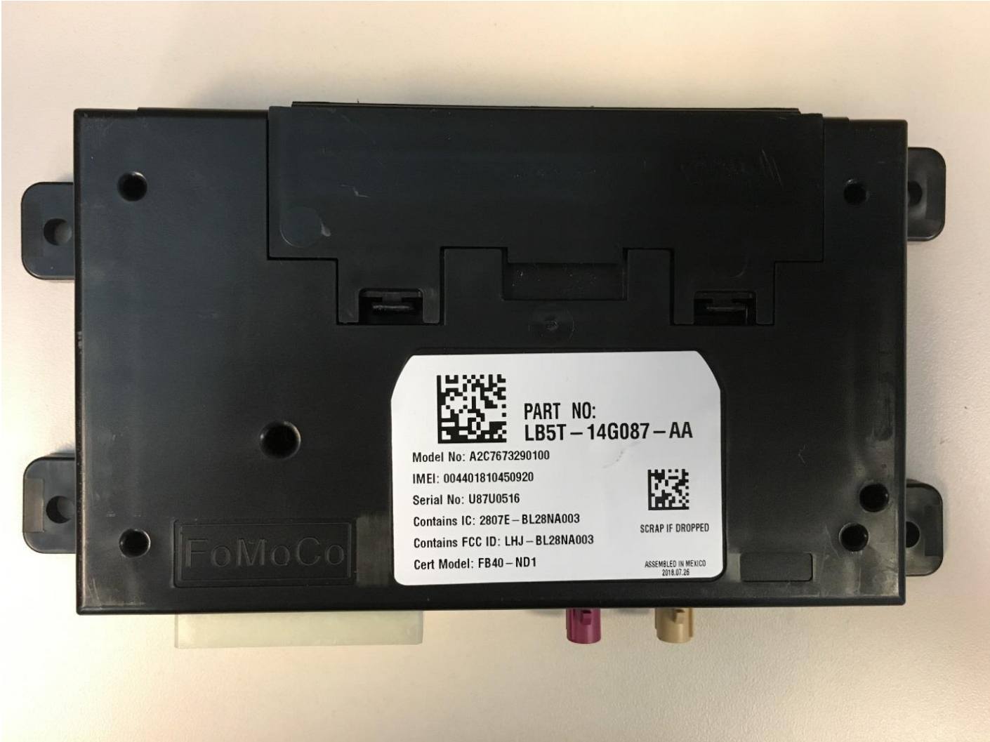
Fig. 1. FB40-ND1 Top side.