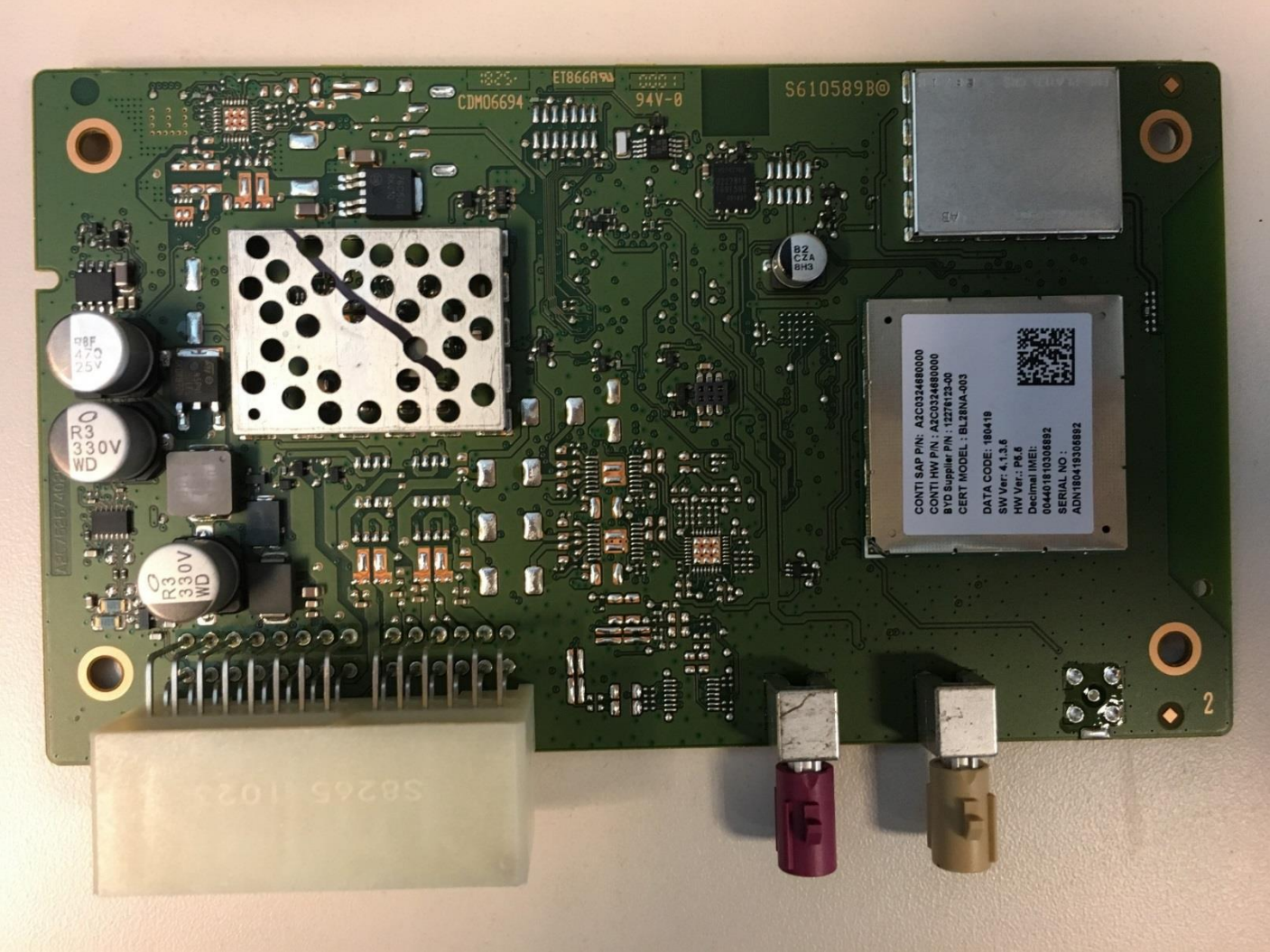
Fig. 3. FB40-ND1 Main pcb side 2.