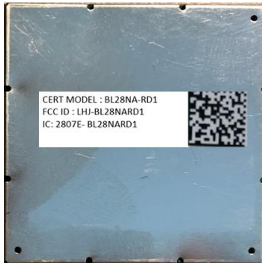
Fig. 1 BL28NA-RD1 module top view