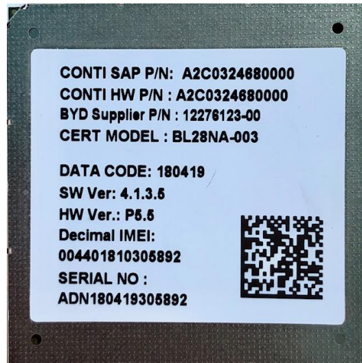
Fig. 1 BL28NA-003 module top view