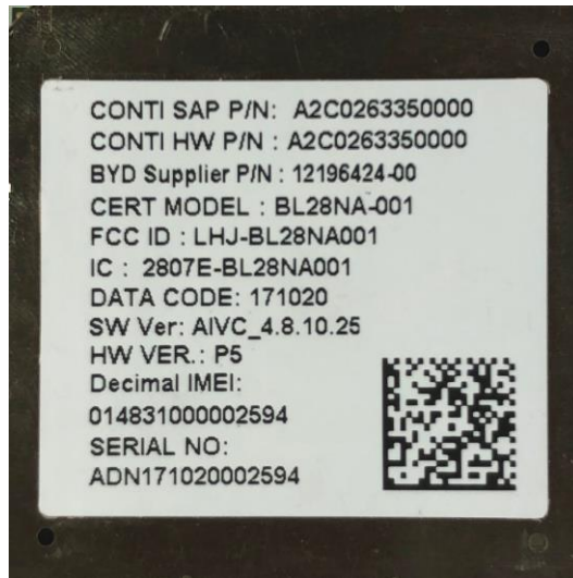
Fig. 1 BL28NA-001 module top view