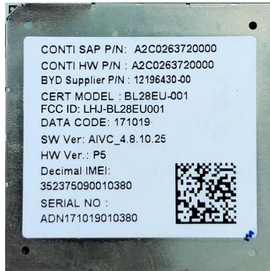
Fig. 1 BL28EU-001 module top view