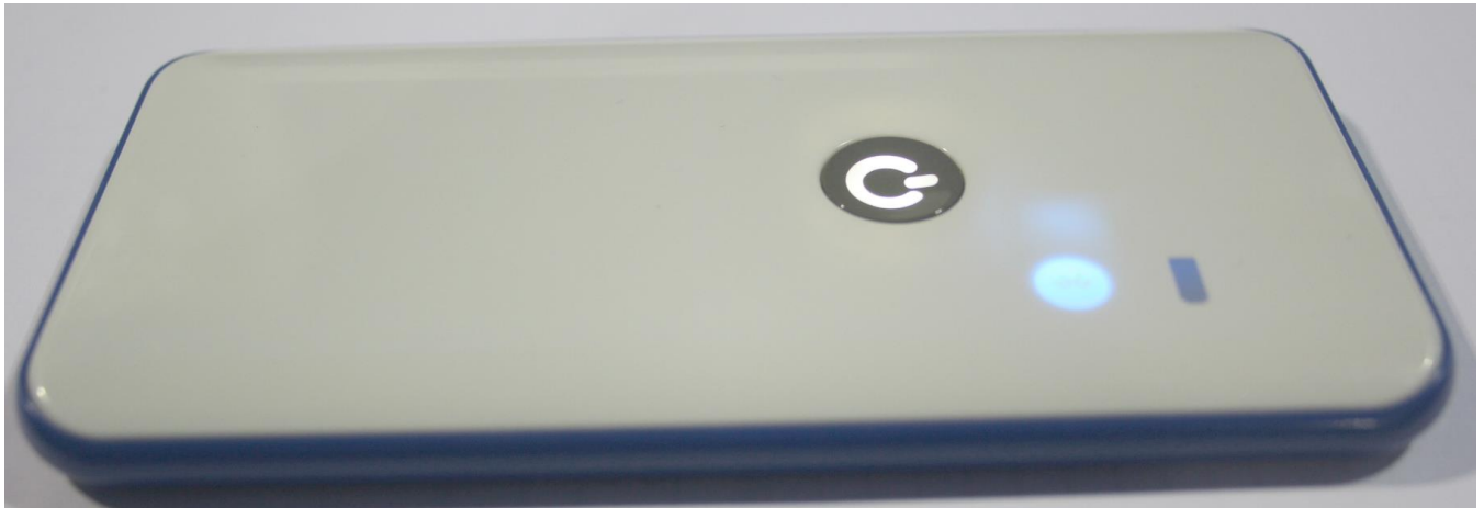
Right side view