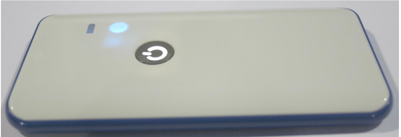
Left side view