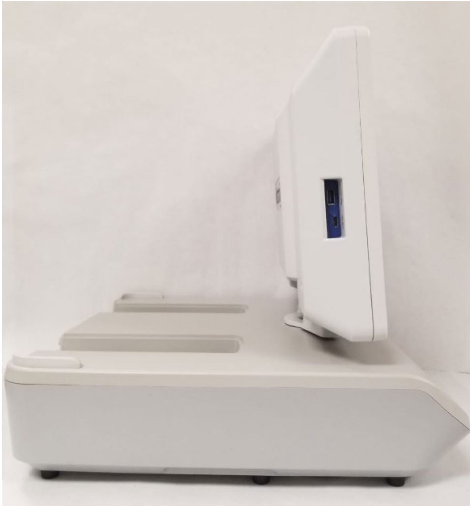
Figure 7 NIM Vital Console, Model NIM4CM01, Left Side View