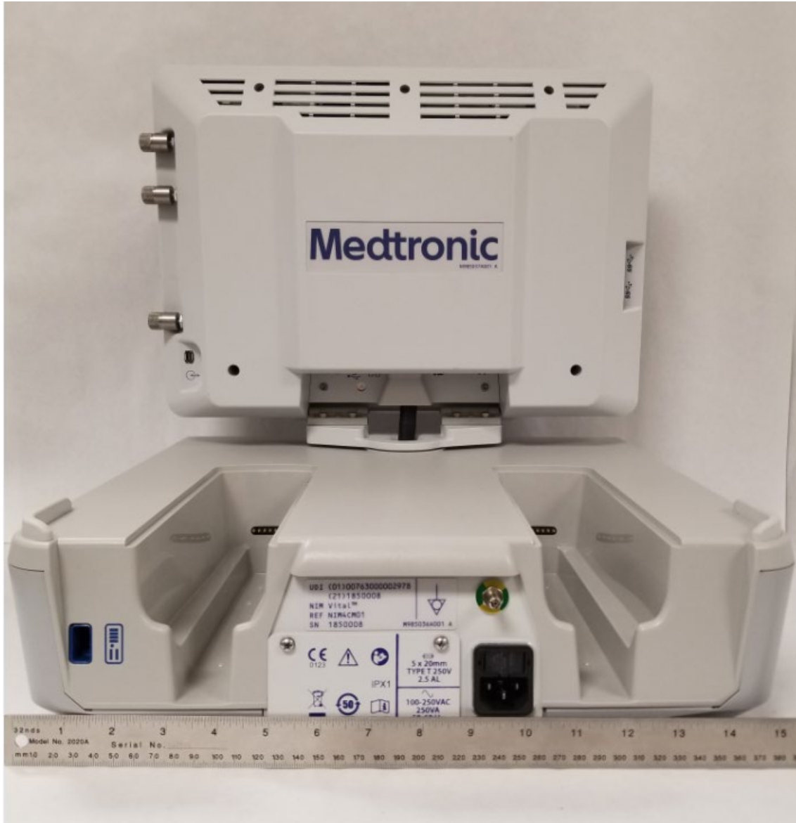
Figure 3 NIM Vital Console, Model NIM4CM01, Rear View (Width) with dimensions