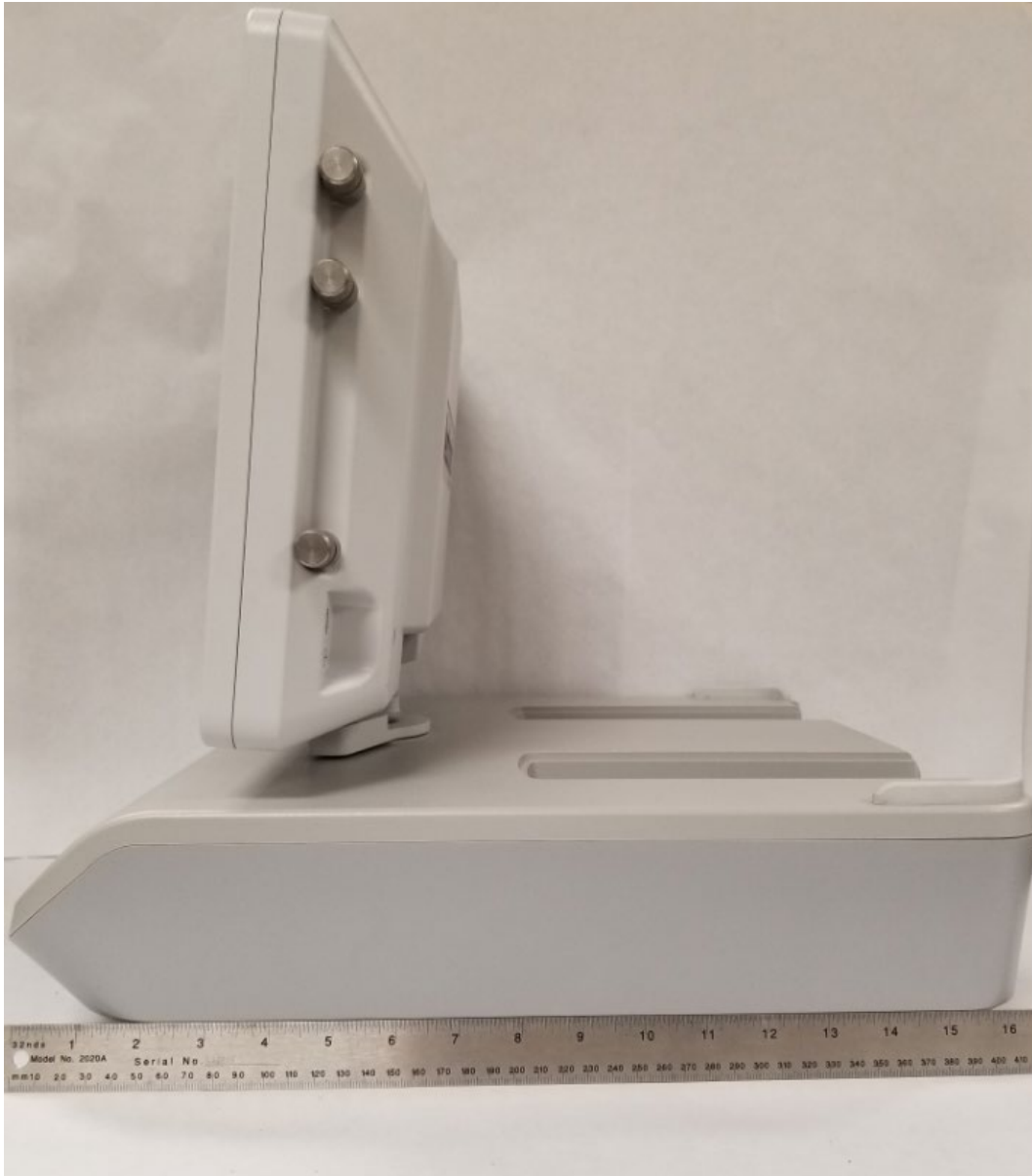
Figure 4: NIM Vital Console, Model NIM4CM01, Right Side View Base (Length) with dimensions