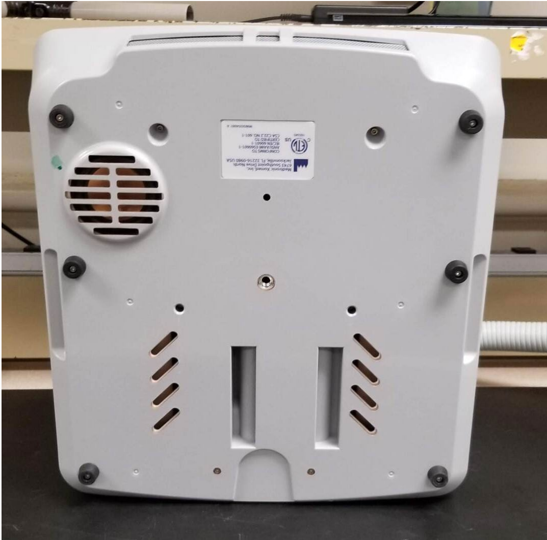
Figure 5 NIM Vital Console, Model NIM4CM01, Bottom Side View