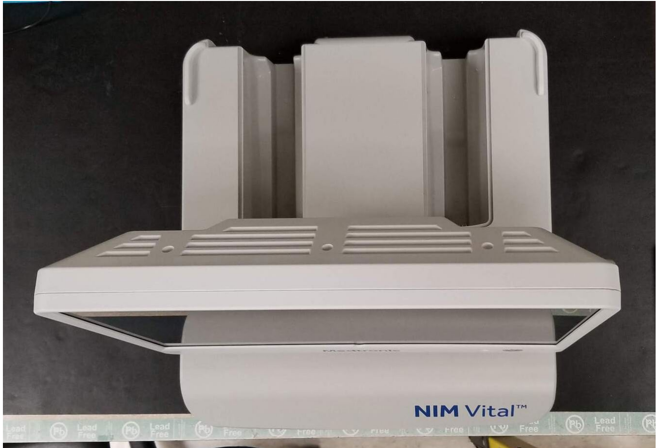
Figure 8 NIM Vital Console, Model NIM4CM01, Top Side View