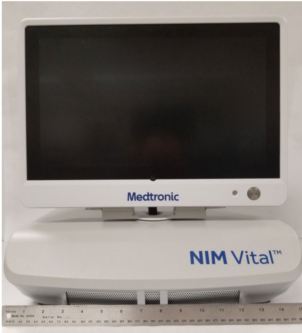
Figure 1 NIM Vital Console, Model NIM4CM01, Front View Base (Width) with dimensions