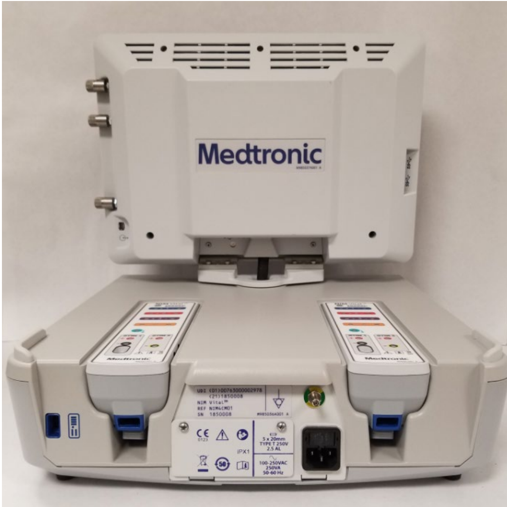
Figure 4 NIM Vital Console, Model NIM4CM01, Rear View including Patient Interfaces