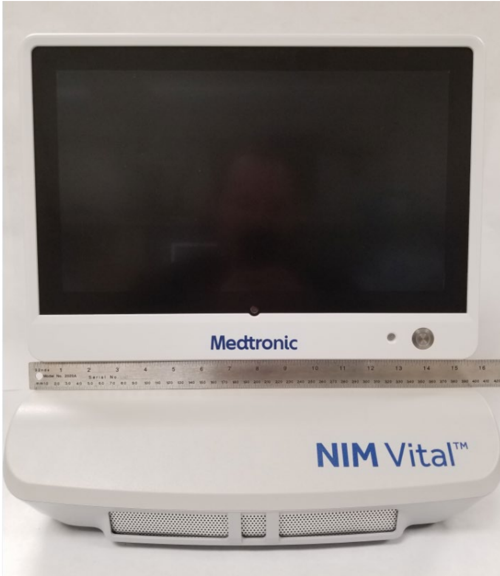
Figure 2 NIM Vital Console, Model NIM4CM01, Front View Screen (Width) with dimensions