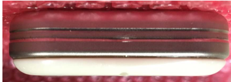
Figure 8: RestoreAdvanced®SureScan MRI, Model: 97713, Bottom Side View