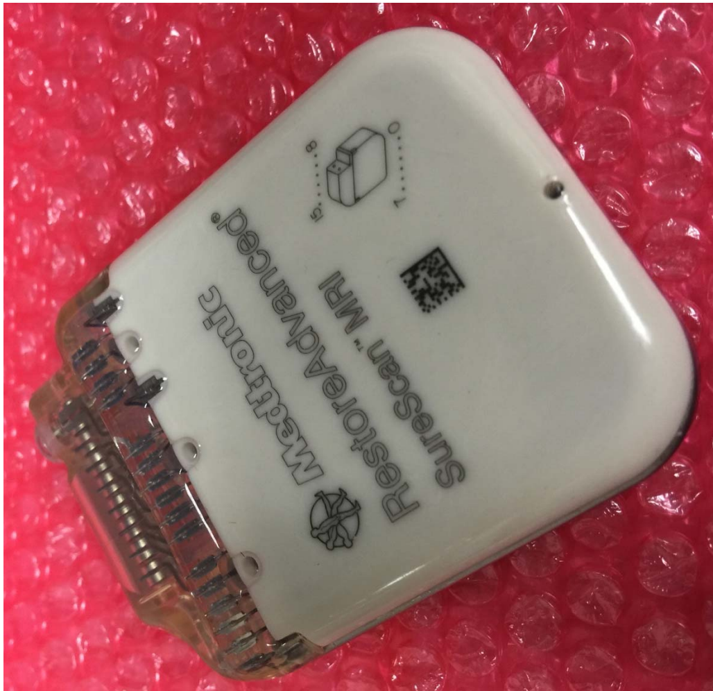
Figure 10: RestoreAdvanced®SureScan MRI, Model: , Asymmetric Left Side View