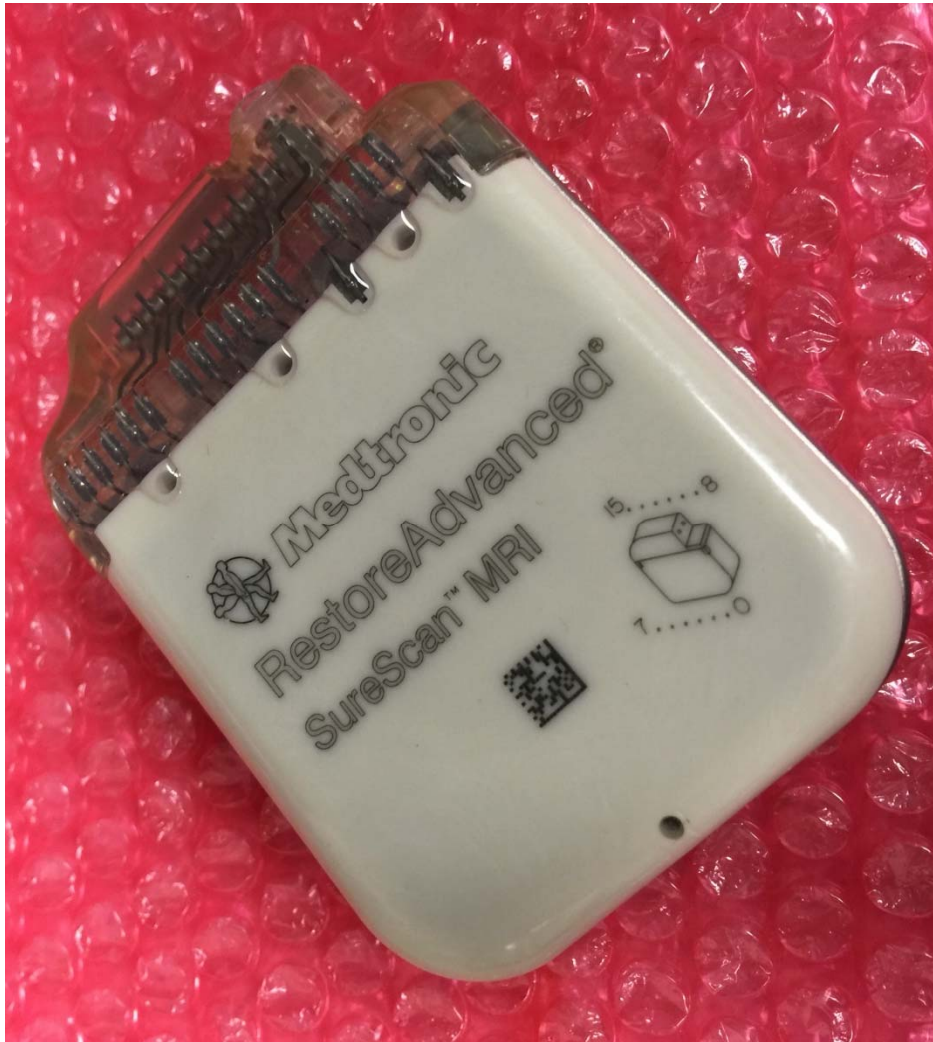
Figure 9: RestoreAdvanced®SureScan MRI, Model: 97713, Asymmetric Right Side View