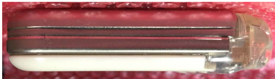
Figure 6: RestoreAdvanced®SureScan MRI, Model: 97713, Left Side View