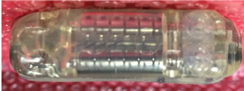
Figure 4: RestoreAdvanced®SureScan MRI, Model: 97713, Top Side View