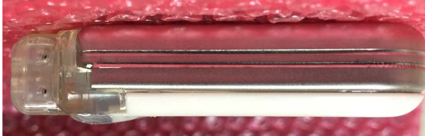
Figure 7: RestoreAdvanced®SureScan MRI, Model: 97713, Top Side View