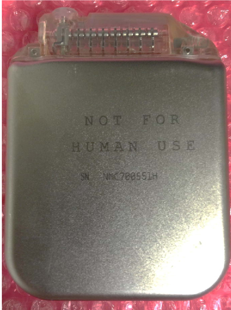
Figure 3: RestoreAdvanced®SureScan MRI, Model: 97713, Rear View