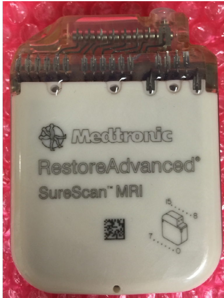
Figure 2: RestoreAdvanced®SureScan MRI, Model: 97713, Front View