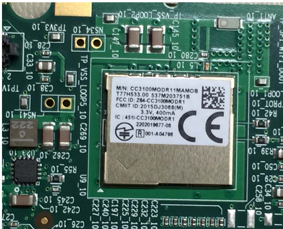
Figure 3: External Neurostimulator, Model: 4NR003, WIFI Module View