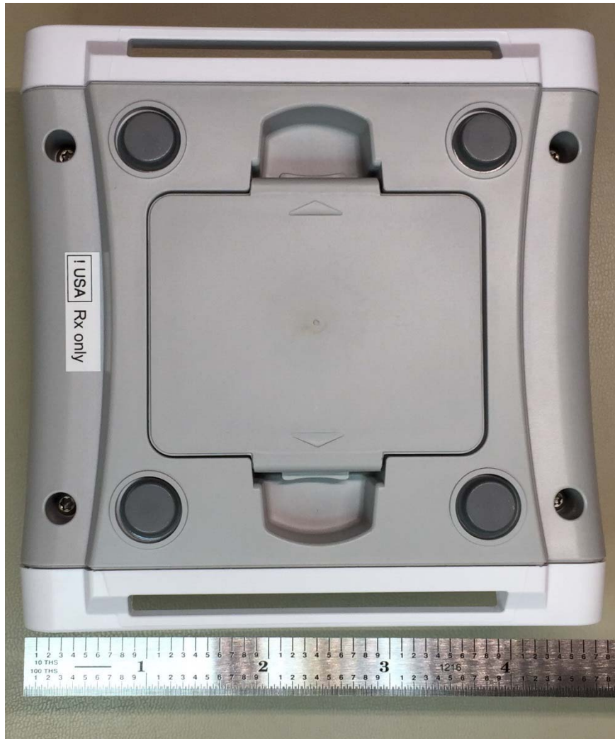
Figure 2: External Neurostimulator, Model: 4NR003, Bottom View