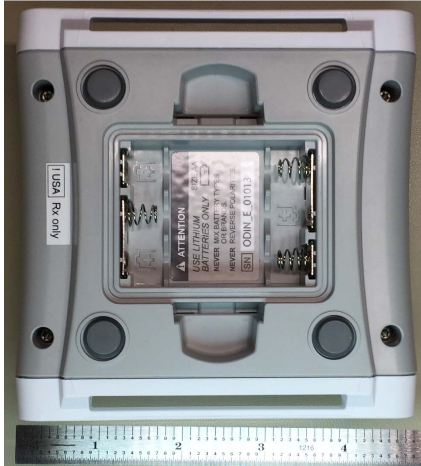
Figure 7: External Neurostimulator, Model: 4NR003, Bottom Battery Compartment View