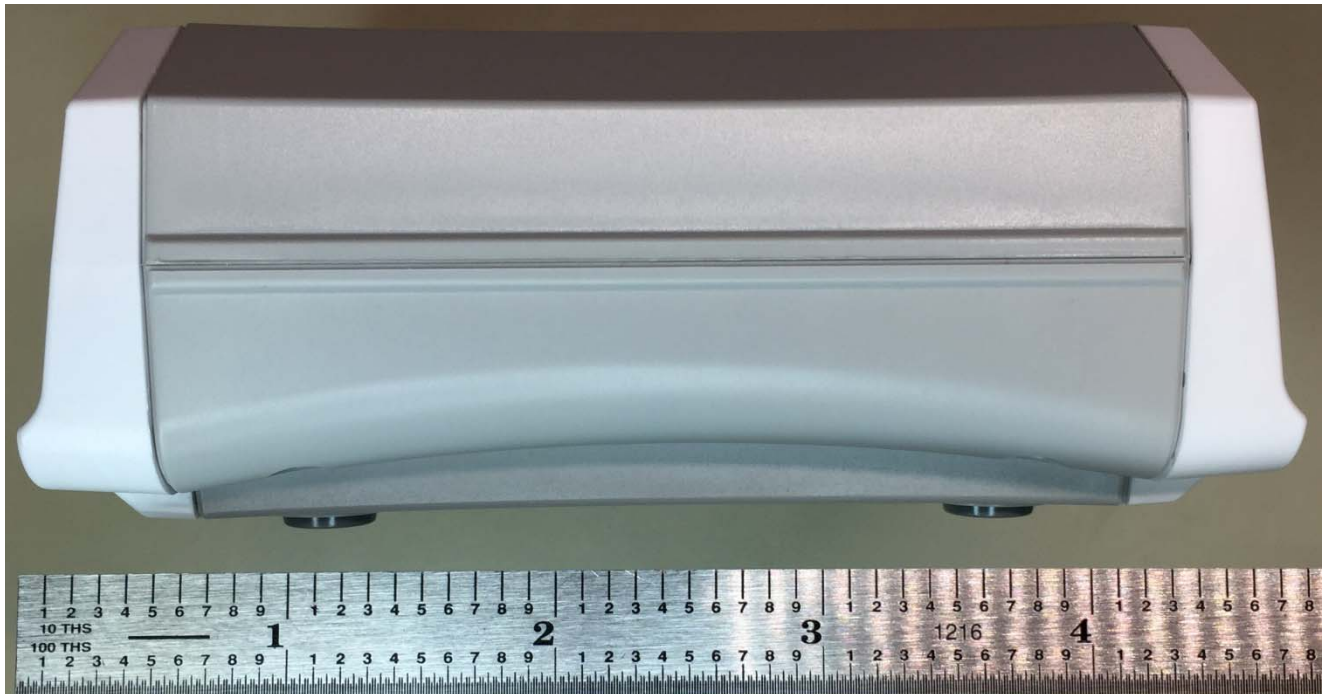
Figure 5: External Neurostimulator, Model: 4NR003, Right Side View