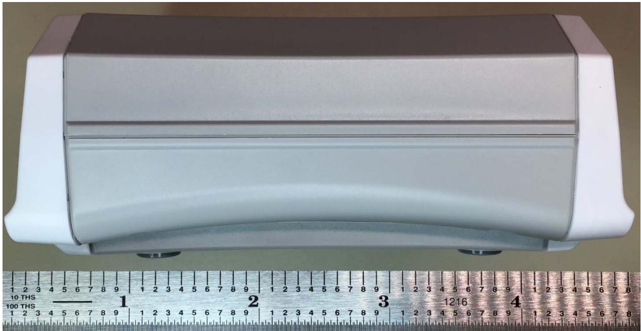
Figure 6: External Neurostimulator, Model: 4NR003, Left Side View