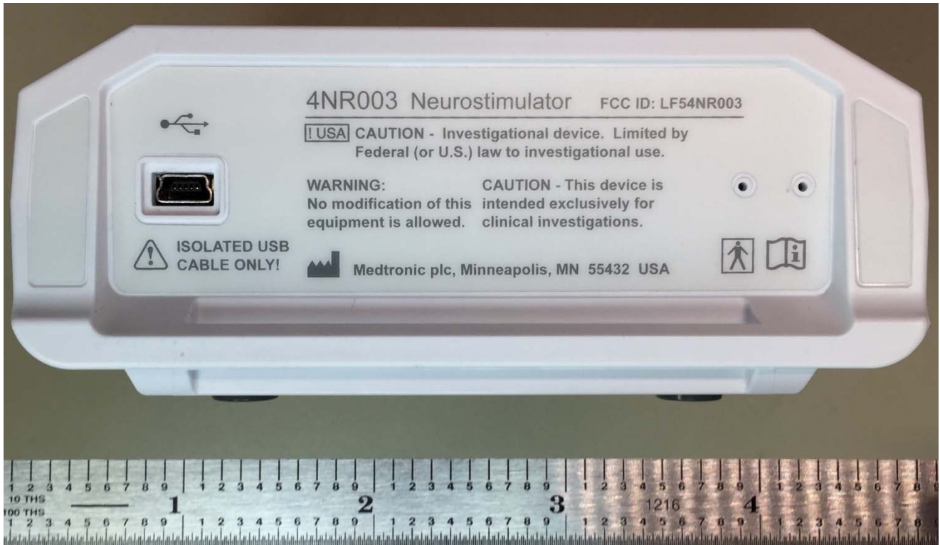
Figure 3: External Neurostimulator, Model: 4NR003, Rear View