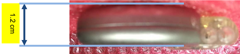
Figure 4: Activa® SC, Model: 37602, Right Side View (with dimension)