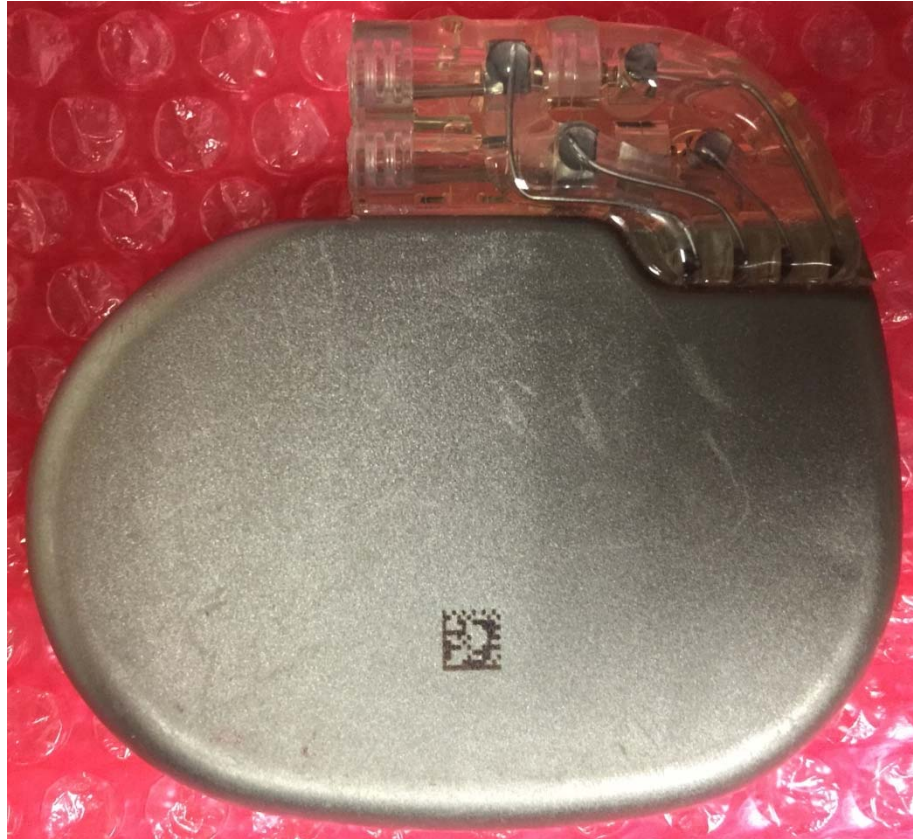
Figure 3: Aactiva® SC, Model: 37602, Rear View