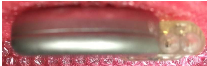
Figure 5: Activa® SC, Model: 37602, Right Side View