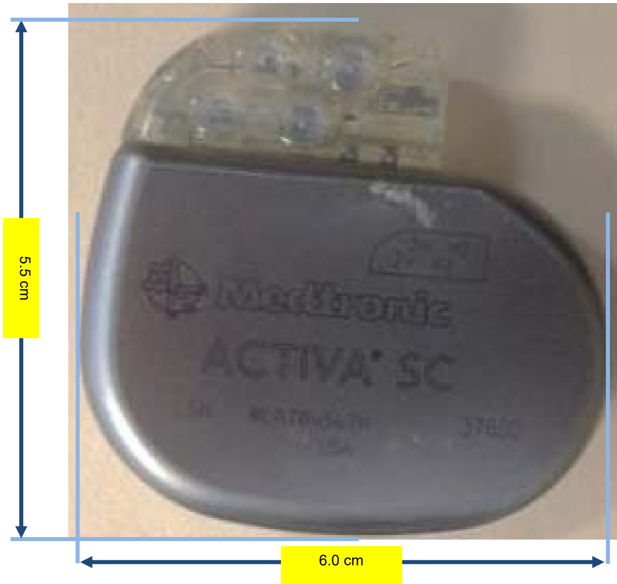
Figure 1: Activa® SC, Model: 37602, Front View (with dimensions)