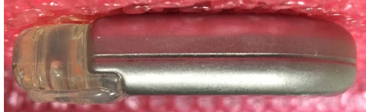
Figure 7: Aactiva® SC, Model: 37602, Left Side View