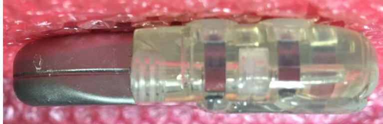
Figure 6: Aactiva® SC, Model: 37602, Top Side View