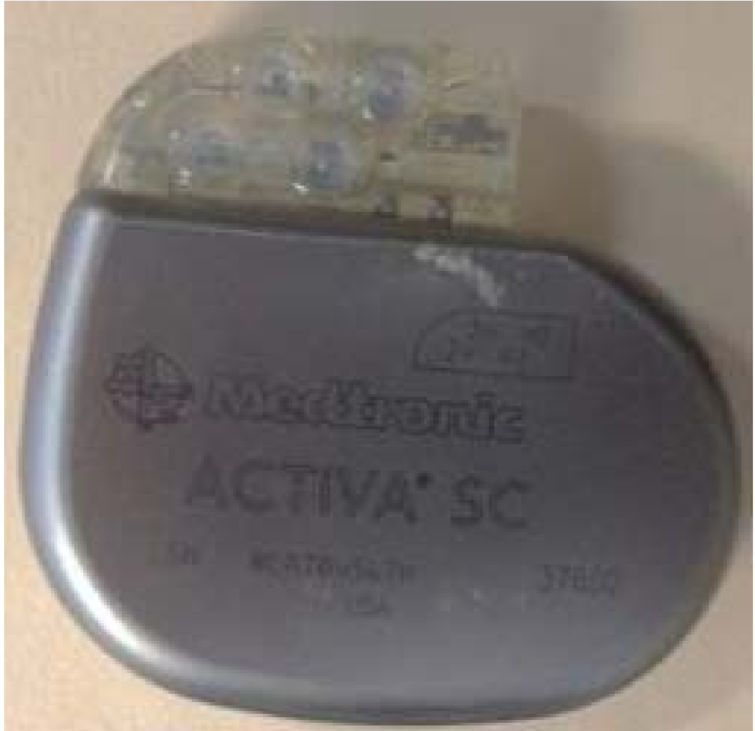
Figure 2: Activa® SC, Model: 37602, Front View

Title: Activa® SC, Model: 37602, External Pictures