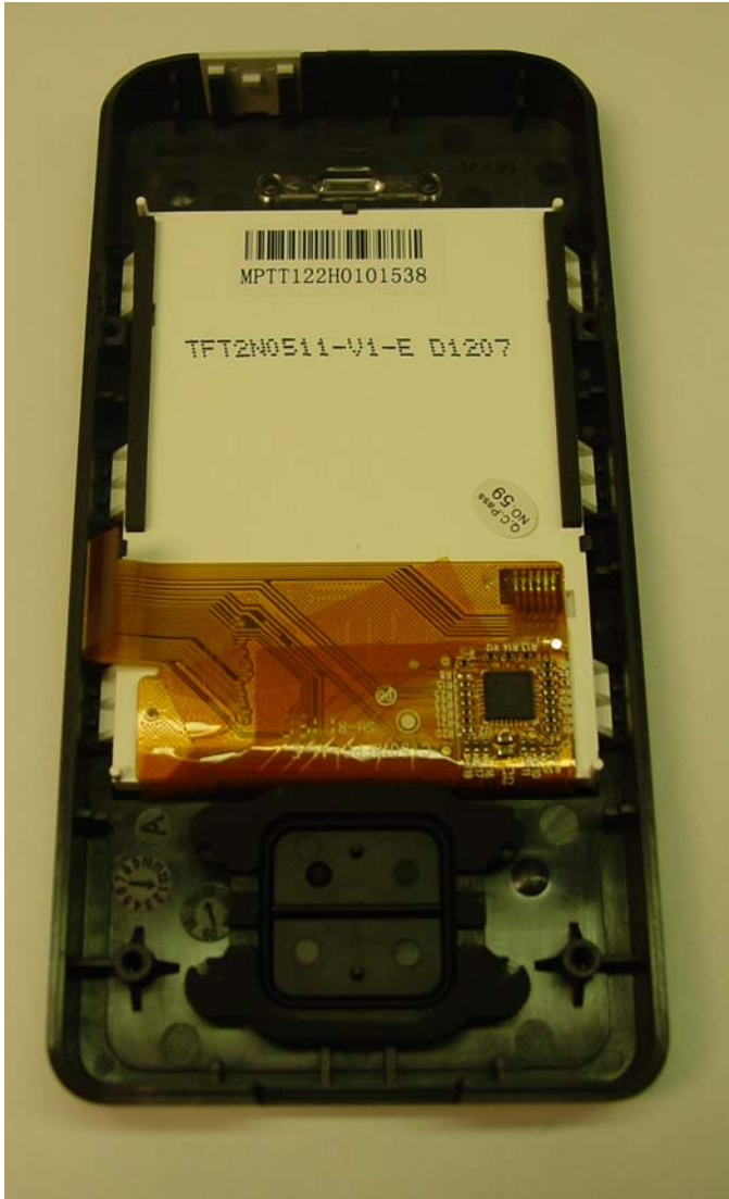
PTM Interstim Model 3537 Internal View of LCD with Flex Circuit