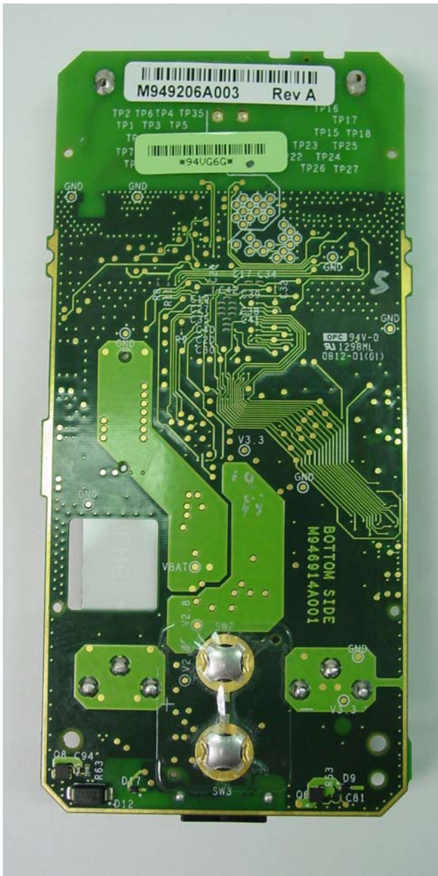
PTM Interstim Model 3537 PCBA Back View