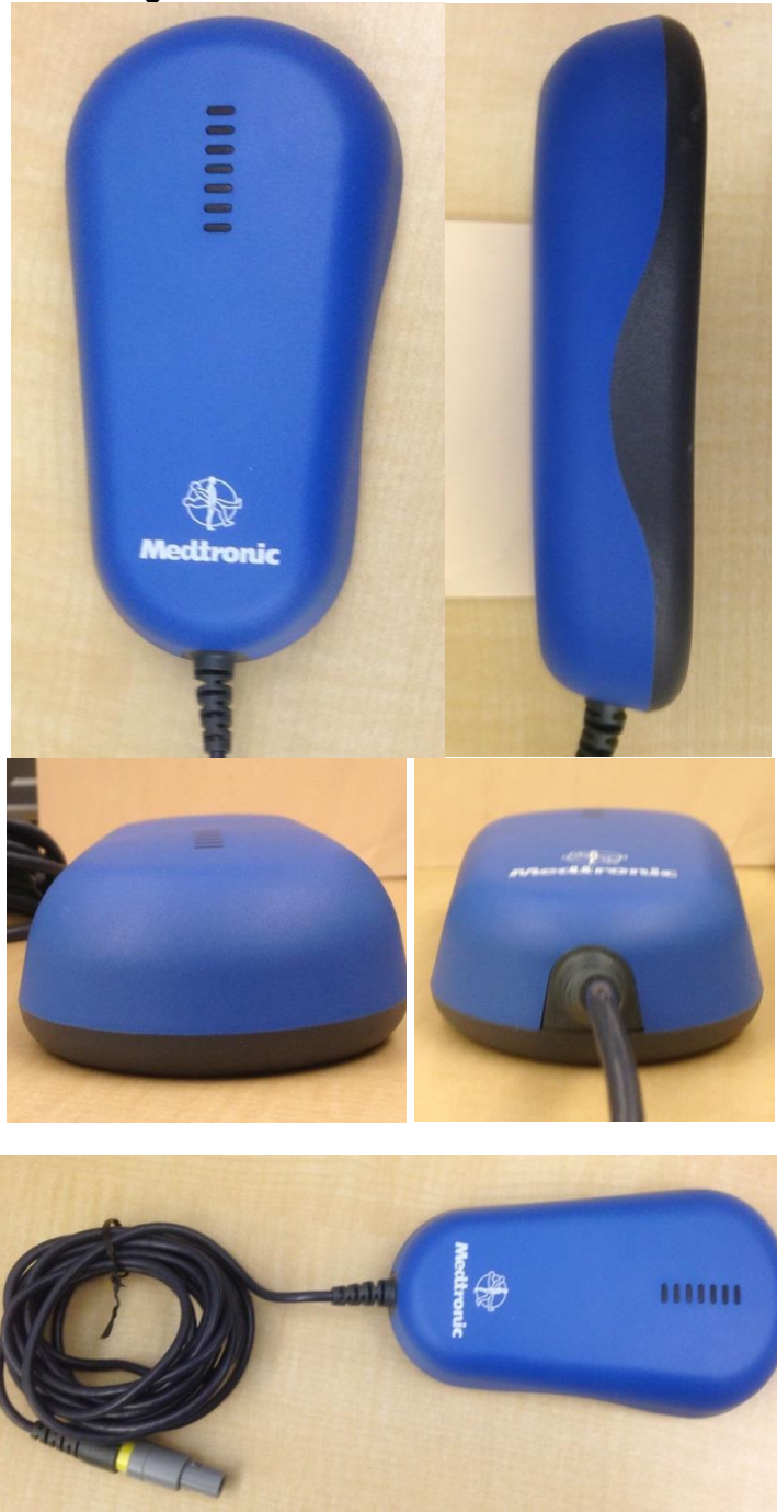
Figure 1. External Pictures – Case View