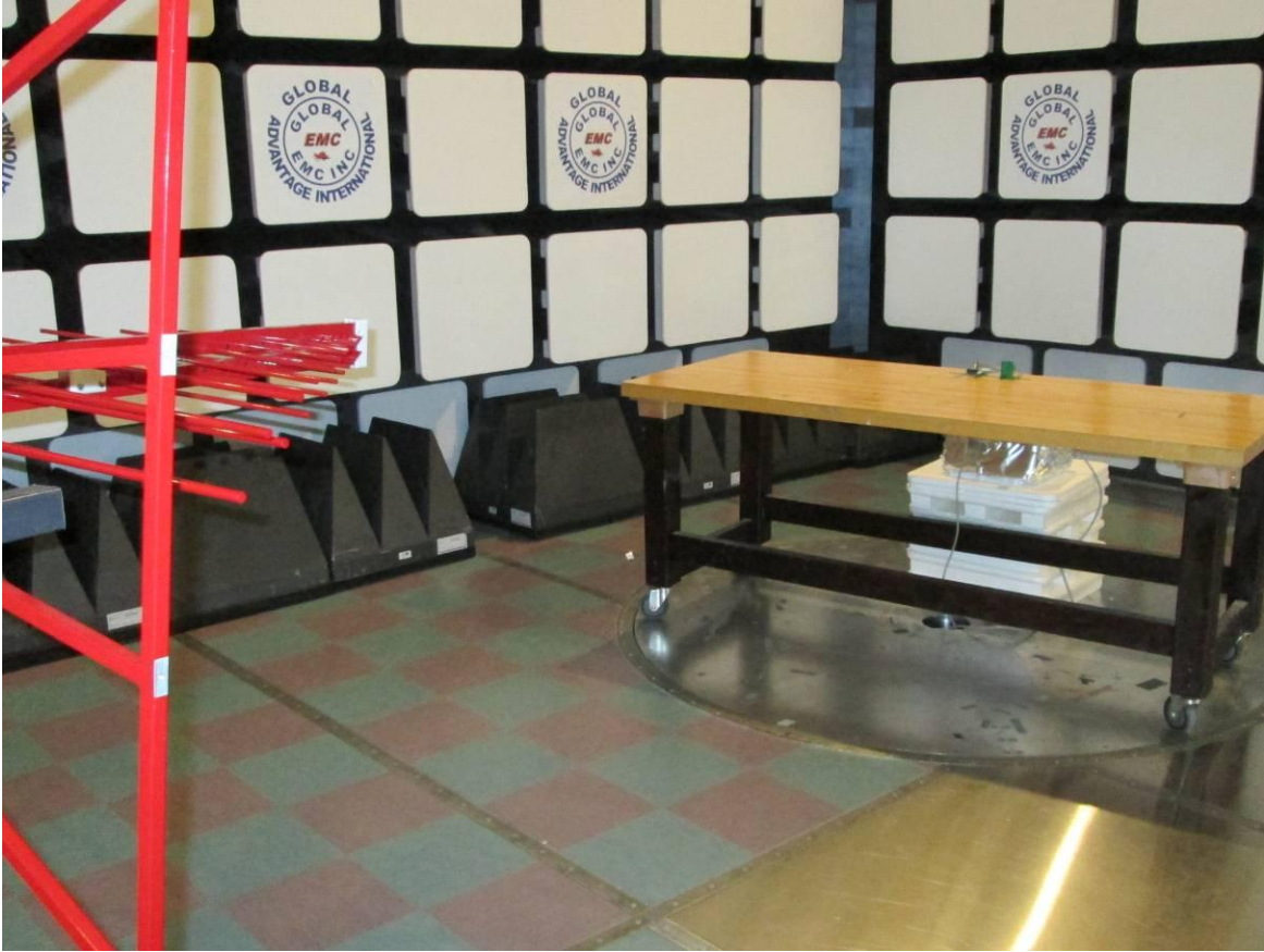
Radiated Emissions – 30 MHz – 1 GHz