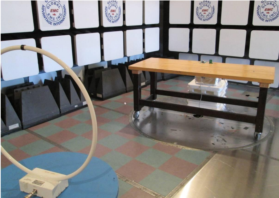
Radiated Emissions – 9 kHz – 30 MHz