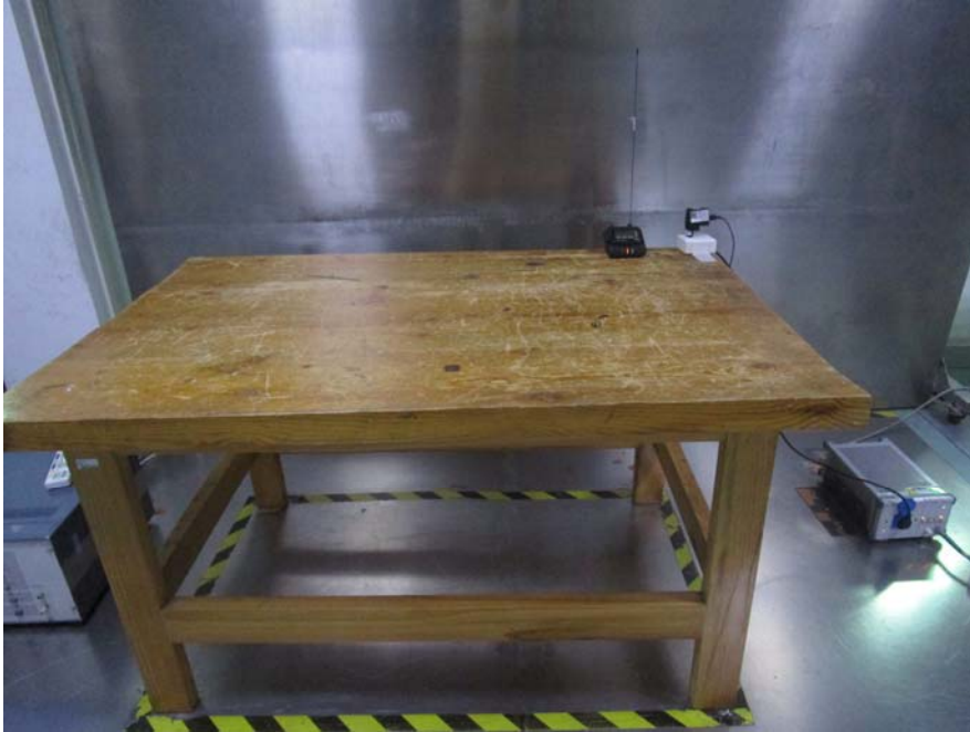
Conducted Emissions TM1 – Side View