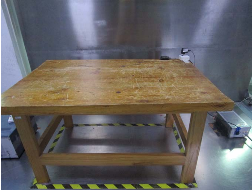
Conducted Emissions TM2– Side View