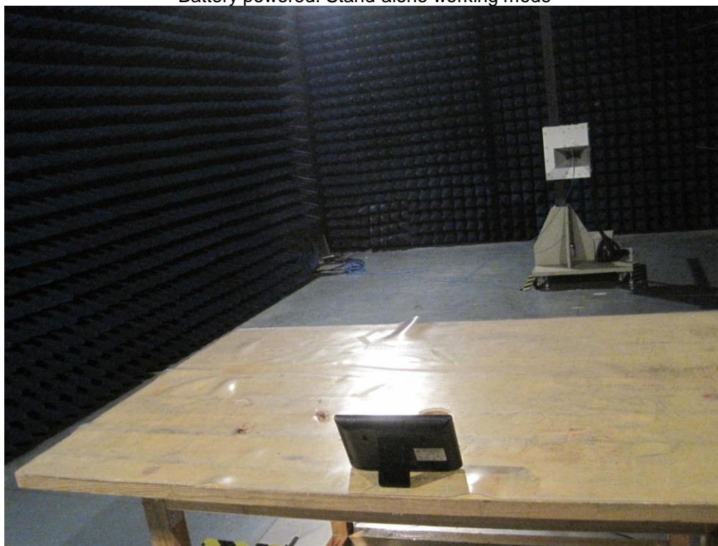
Battery powered: Stand-alone working mode