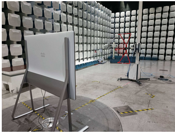
Radiated Emissions 30 – 1000 MHz