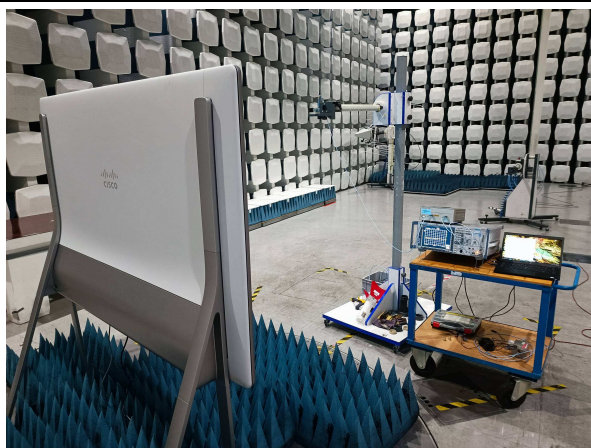
Radiated Emissions above 18 GHz