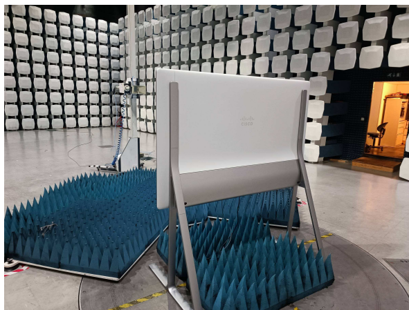
Radiated Emissions 1 – 18 GHz