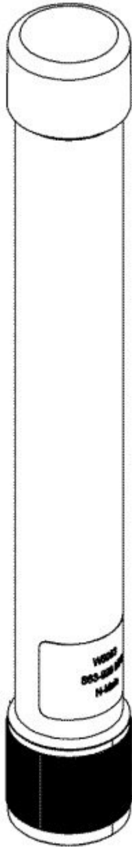
Figure 1: Cisco ANT-WPAN-OD-OUT-N Antenna