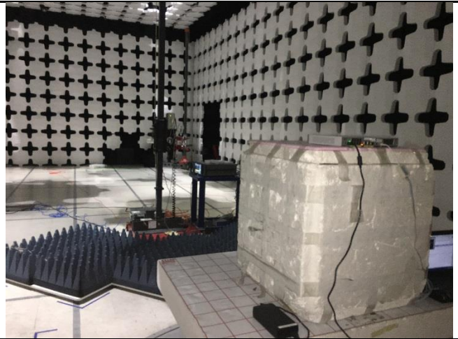
Radiated Emission Above 1G – Rear View