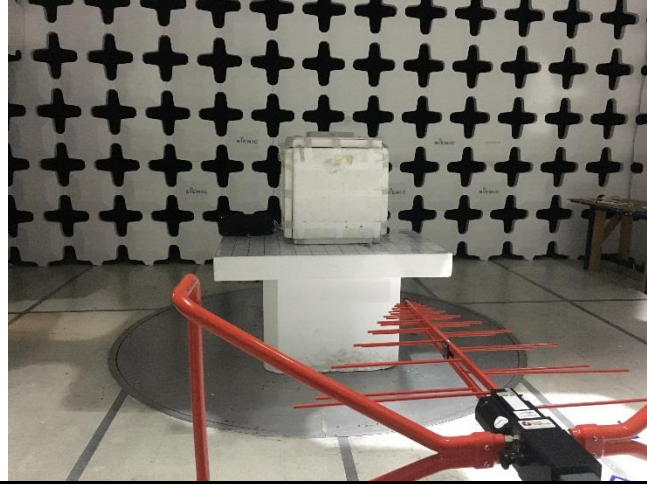
Radiated Emission Below 1G – Front View