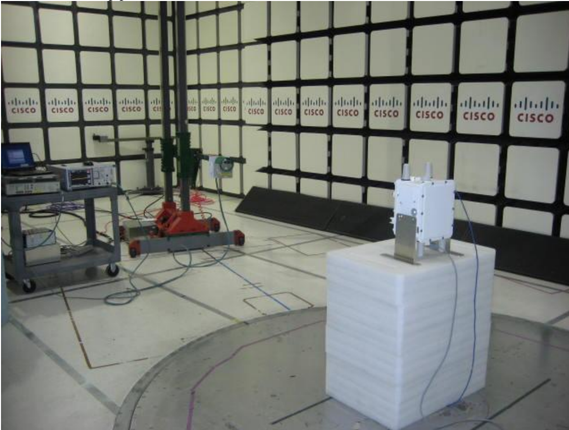
Radiated Test setup for 18-40GHz in 5m chamber