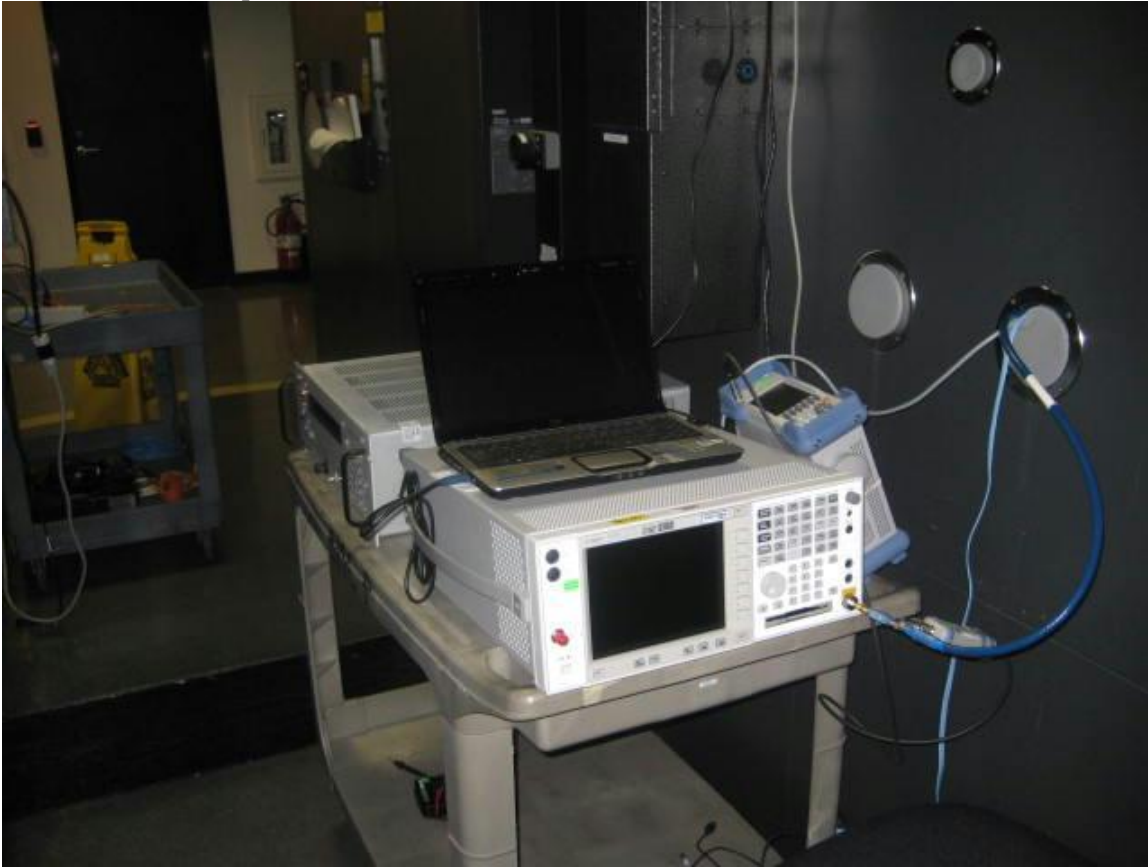
Conducted Test setup Test equipment outside Temperature chamber