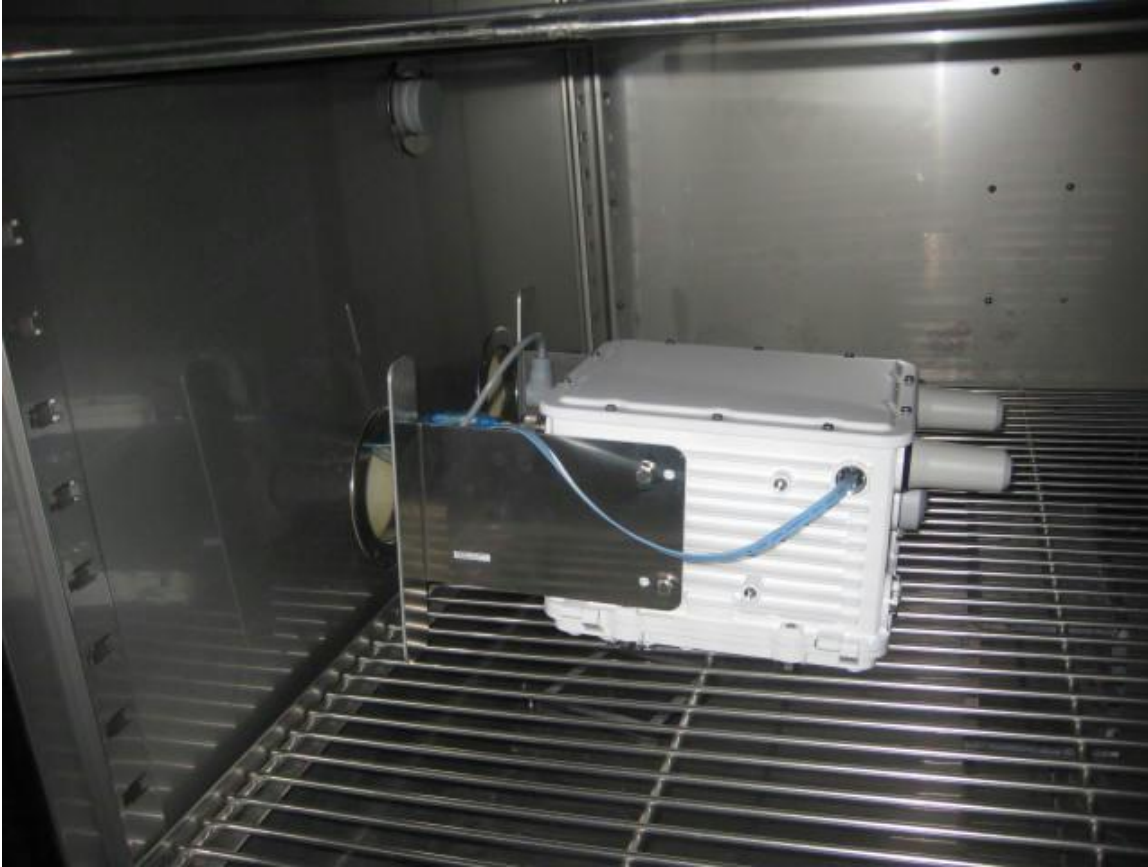
CGR1240 in Temperature chamber