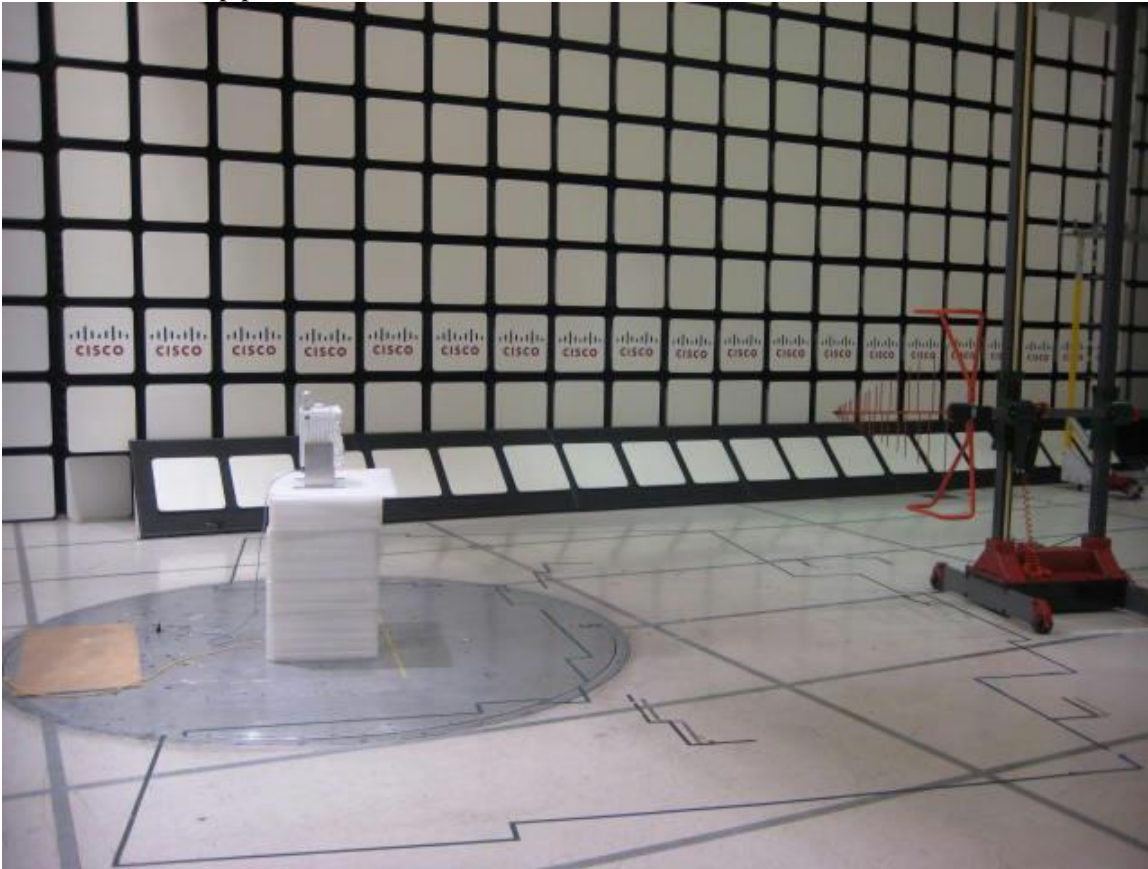
Radiated Emissions test setup for 30MHz to 1GHz in 10m chamber. Support is made of Styrofoam