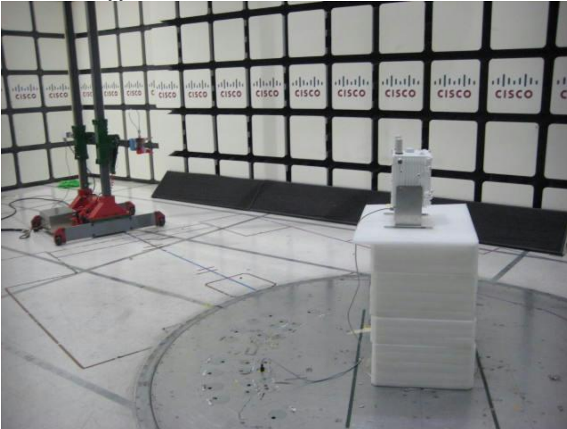
Radiated Test setup for 1-18GHz in 5m chamber.