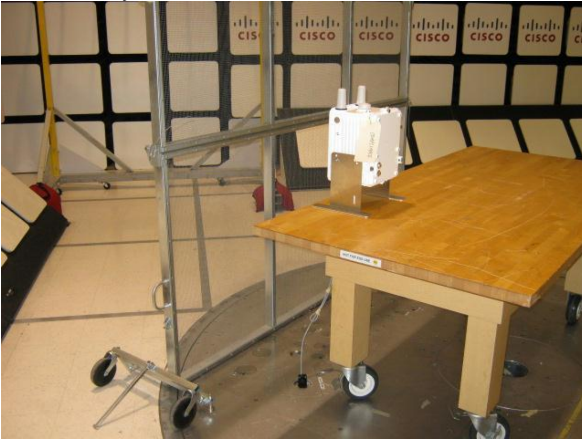
Conducted Test setup (AC mains LISN)

Vertical ground plane is bonded to turntable. a separation of 40cm is maintained from EUT to VCP. Height of table is 80cm. LISN is flush mounted to turntable