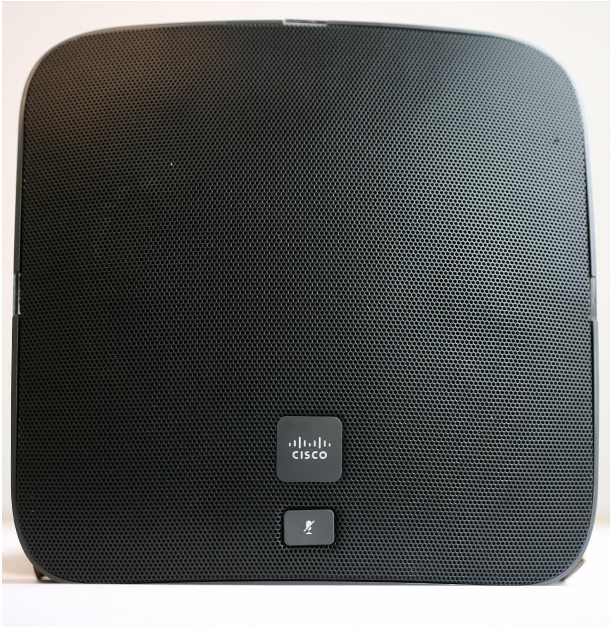
Beignet base top