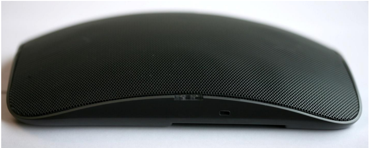
Beignet base rear