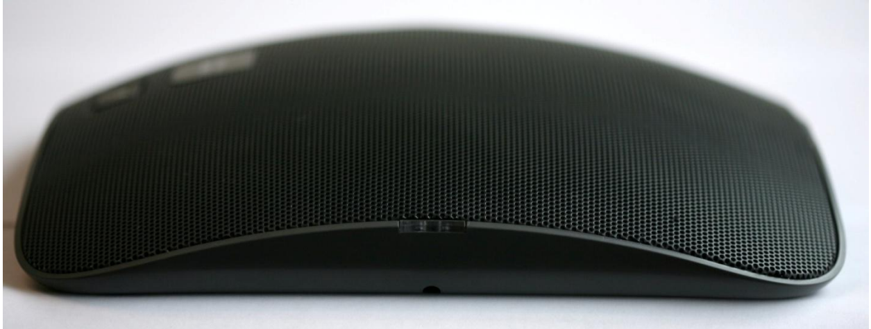
Beignet base Right side