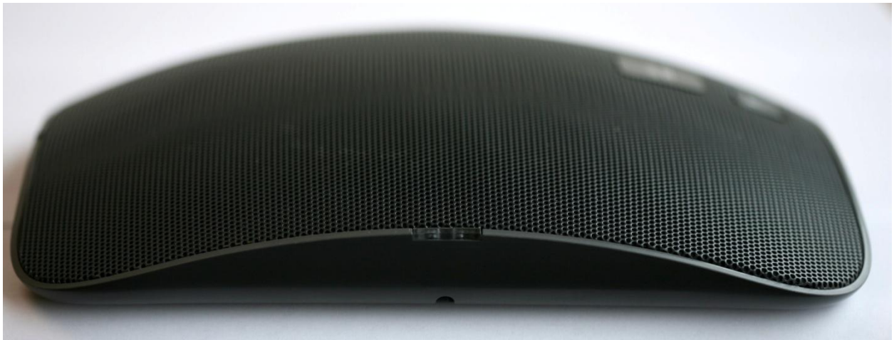
Beignet base left hand side