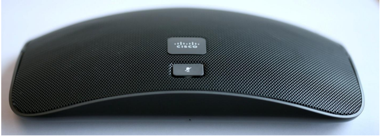
Beignet Base front