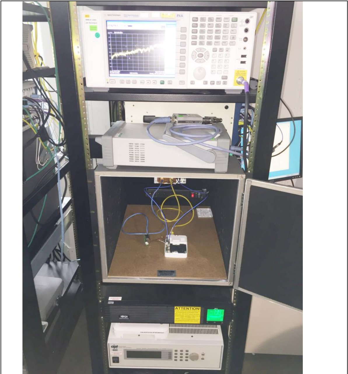
Title: Conducted Test Setup

This is a dual band 2.4GHz / 5GHz device. All ports in this test set up photo are connected as all testing is automated.