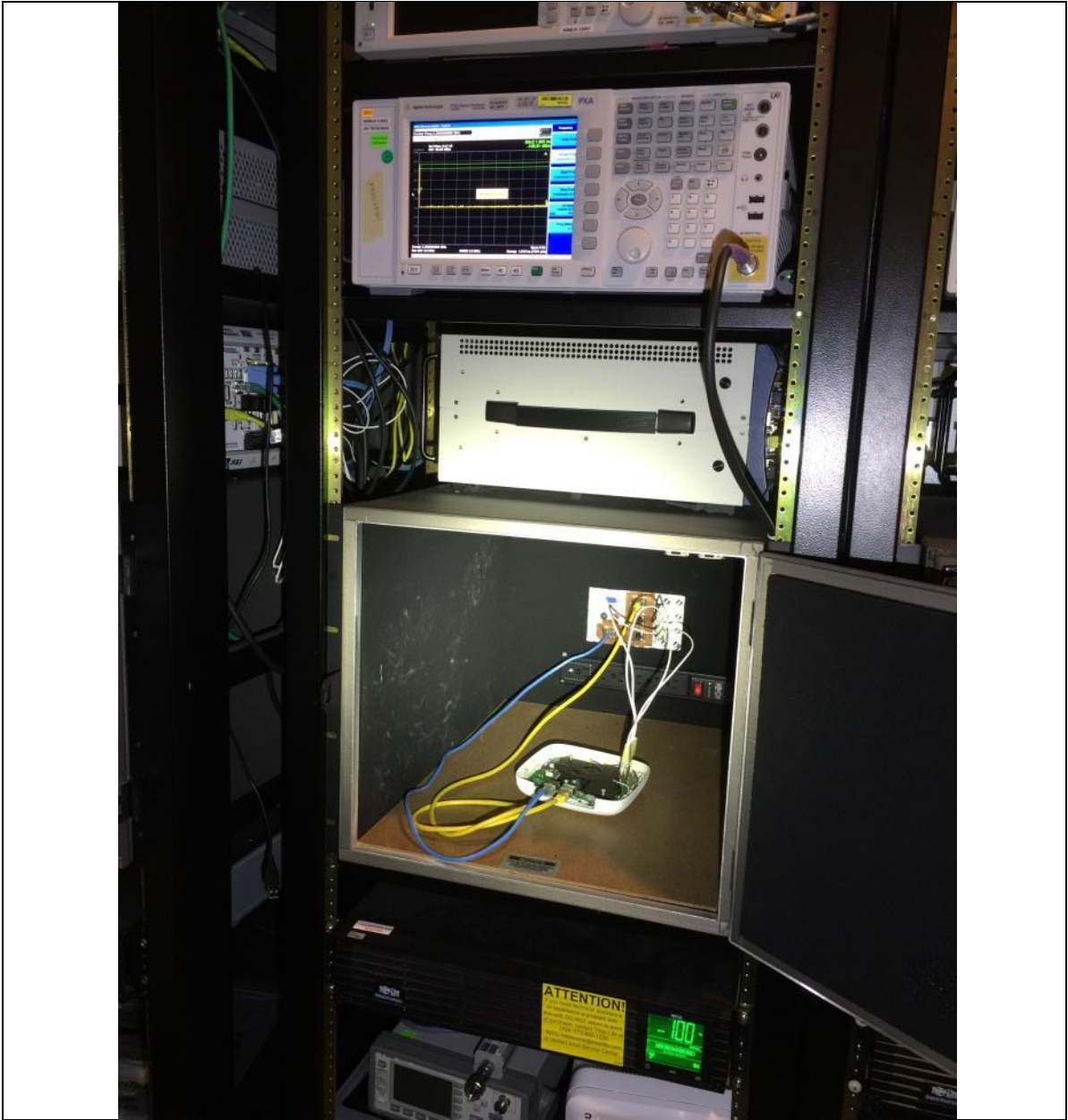
Title: Conducted Test Setup

This is a dual band 2.4GHz / 5GHz device. All ports in this test set up photo are connected as all testing is automated.