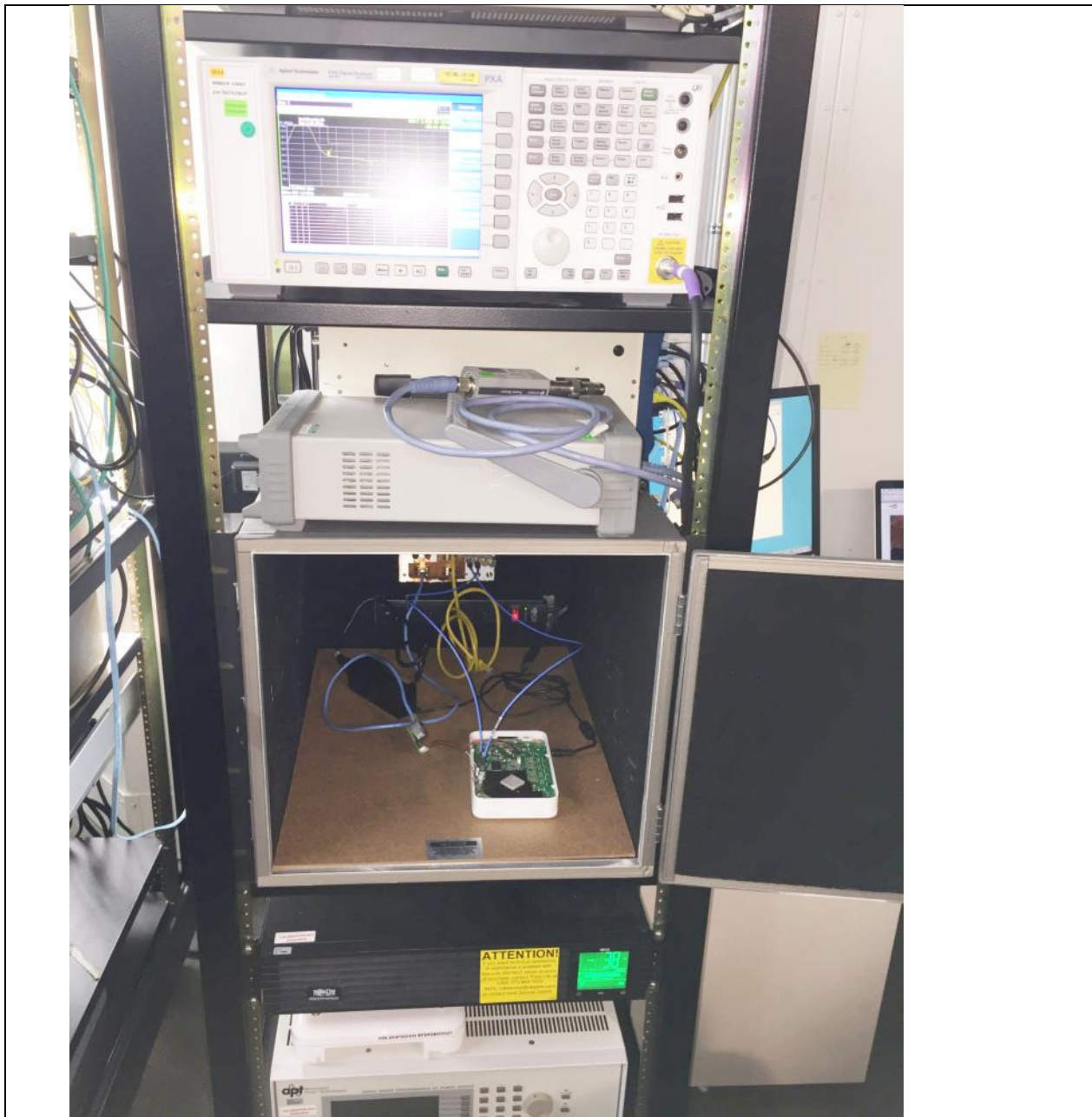
Title: Conducted Test Setup

This is a dual band 2.4GHz / 5GHz device. All ports in this test set up photo are connected as all testing is automated. Section 2.6 of this test report given an overview of the different Tx antenna combinations used by this device.