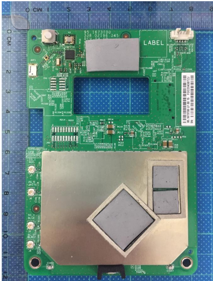
Top Side Board