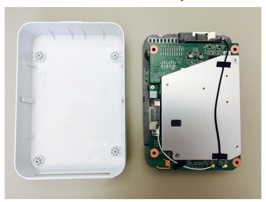
Top Side RF Board with shields