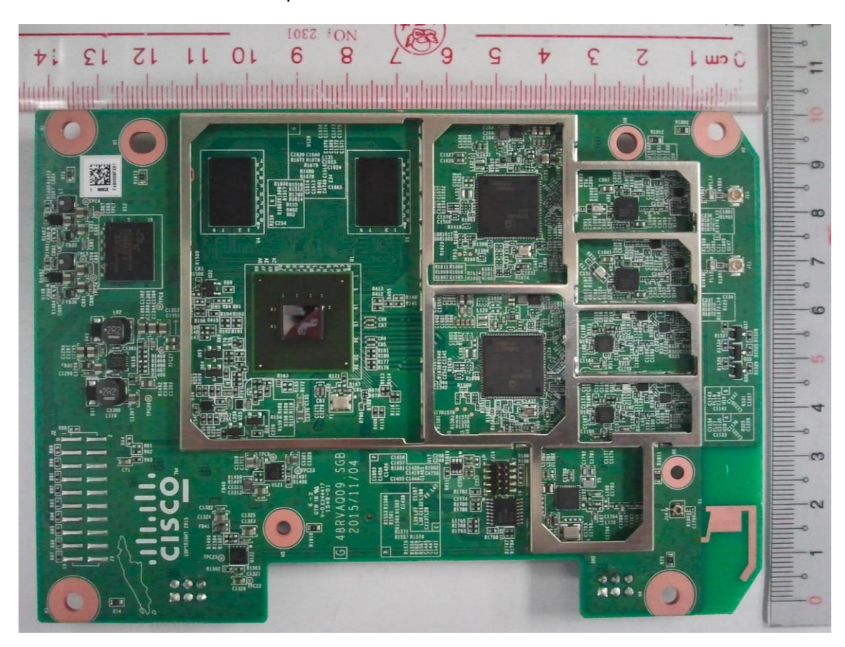
Bottom Side RF Board with Shields