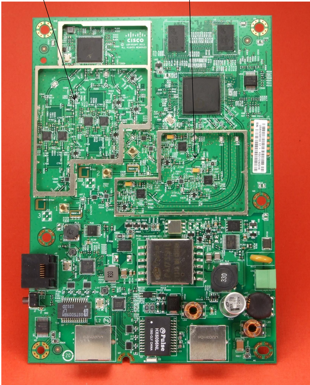
PCB Top – covers removed