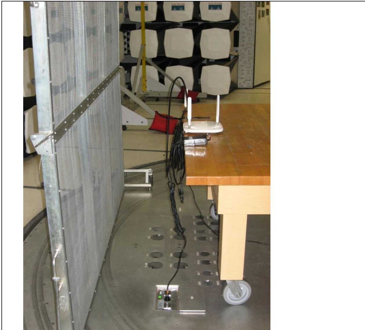
Title: Conducted Emissions Configuration Photograph