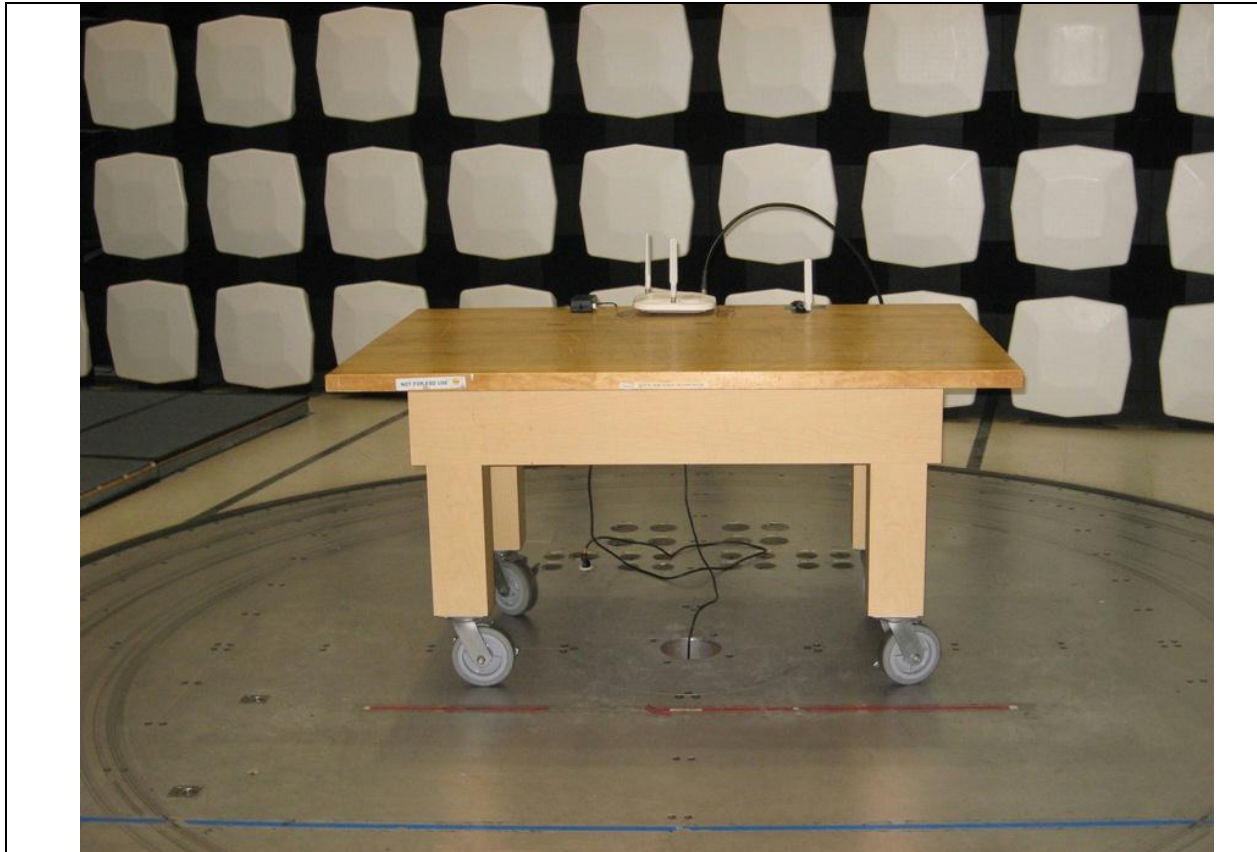
Title: Radiated Emissions Configuration Photograph