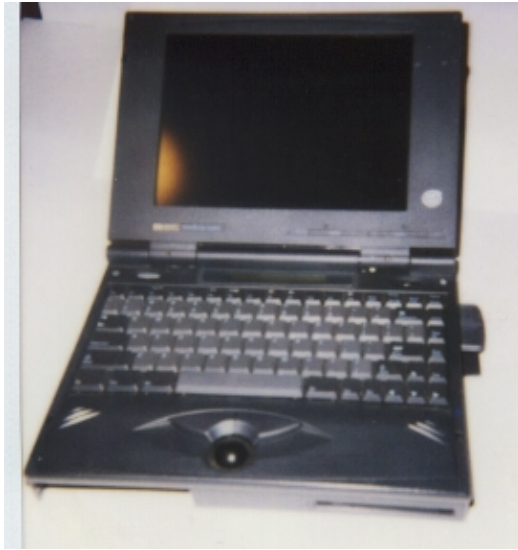
Fig. 1. Photograph of Cisco/Aironet Model LDK102038 Wireless PC with RF antenna inserted at the back on the right-hand side of the keyboard.