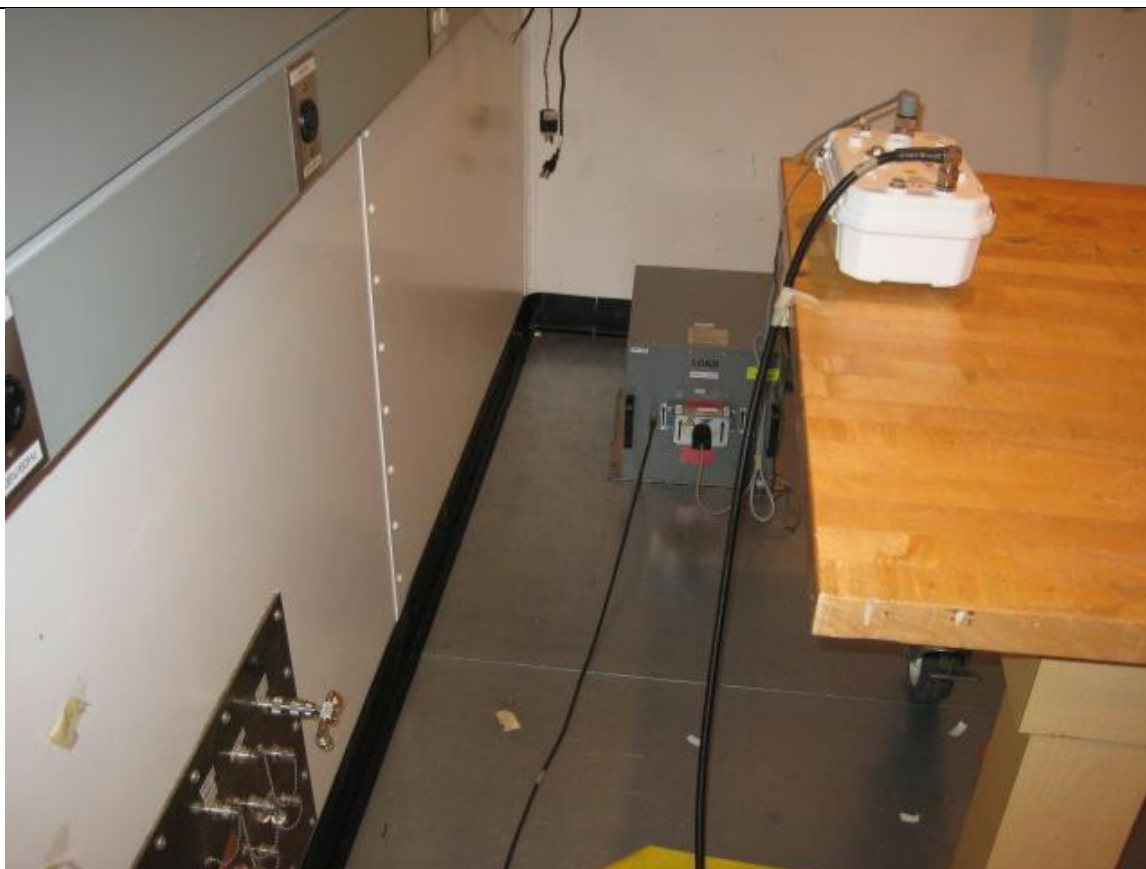
Title: CE on Power Line_Full View