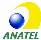
Figure 1: Brazil Regulatory Information