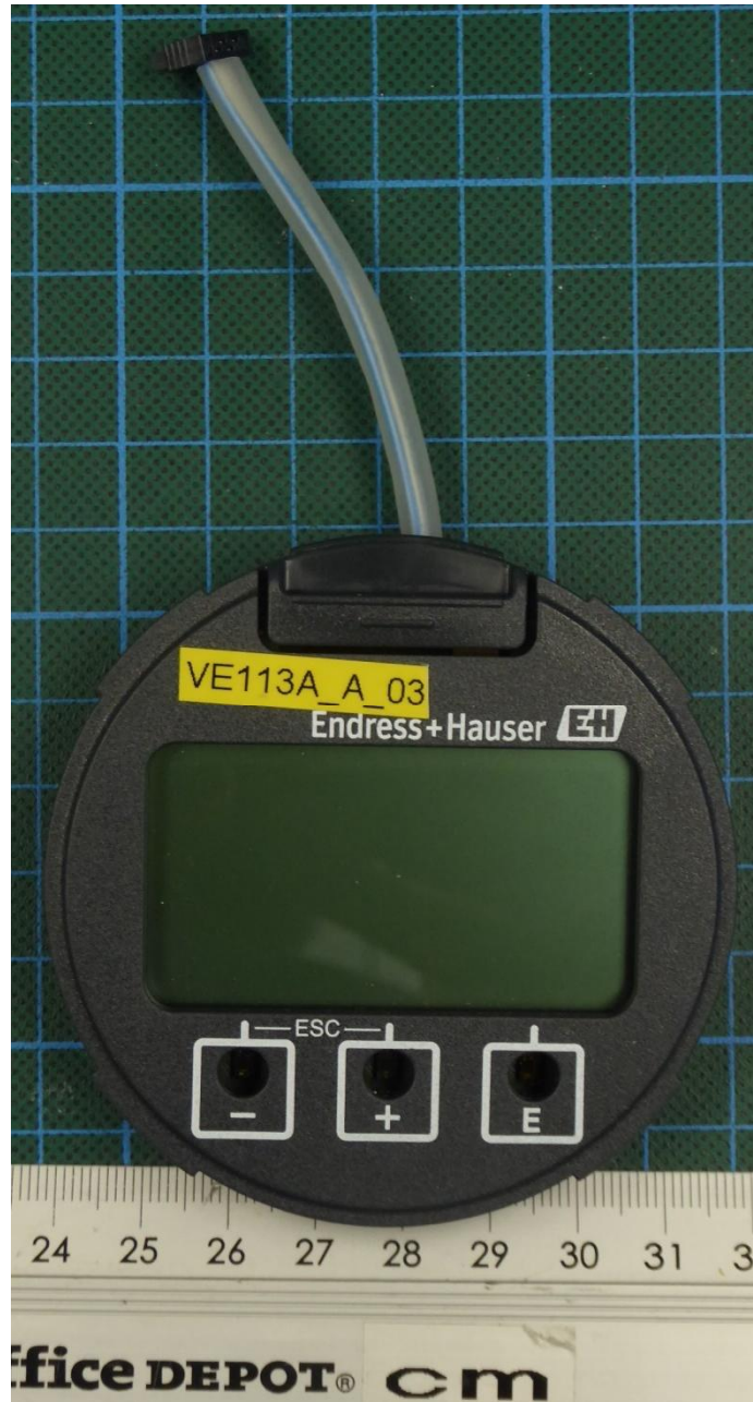
EUT VE113_A_03 – top view