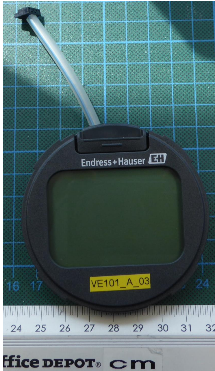
EUT VE101_A_03 – top view