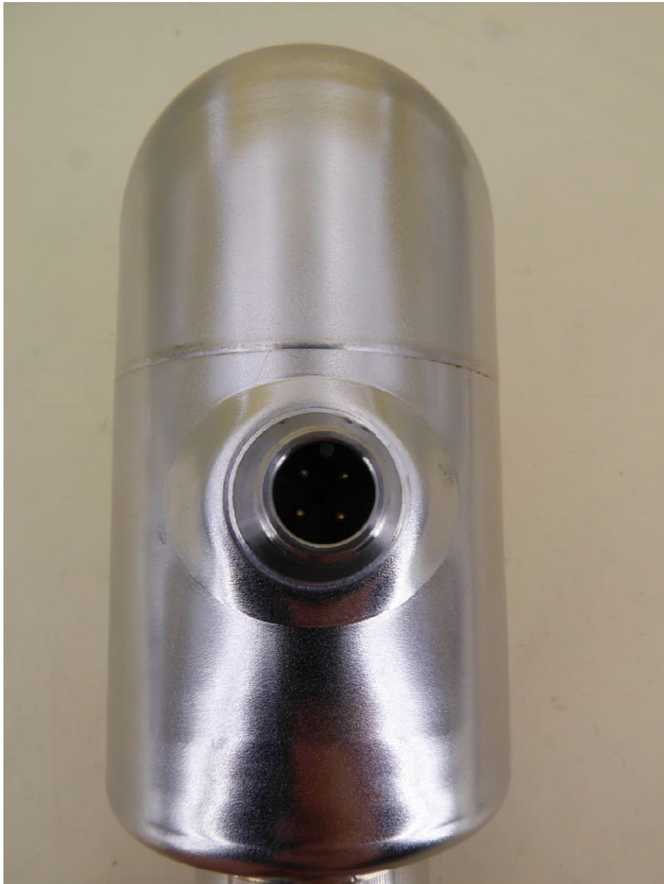
EUT 1, connector view