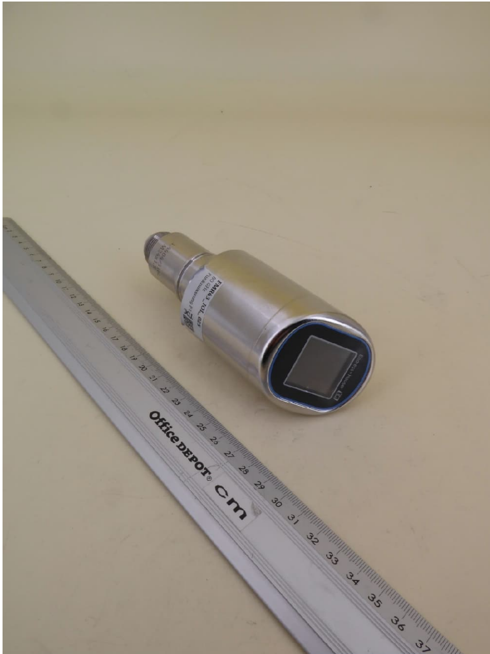
EUT 1, 3-D-view 1