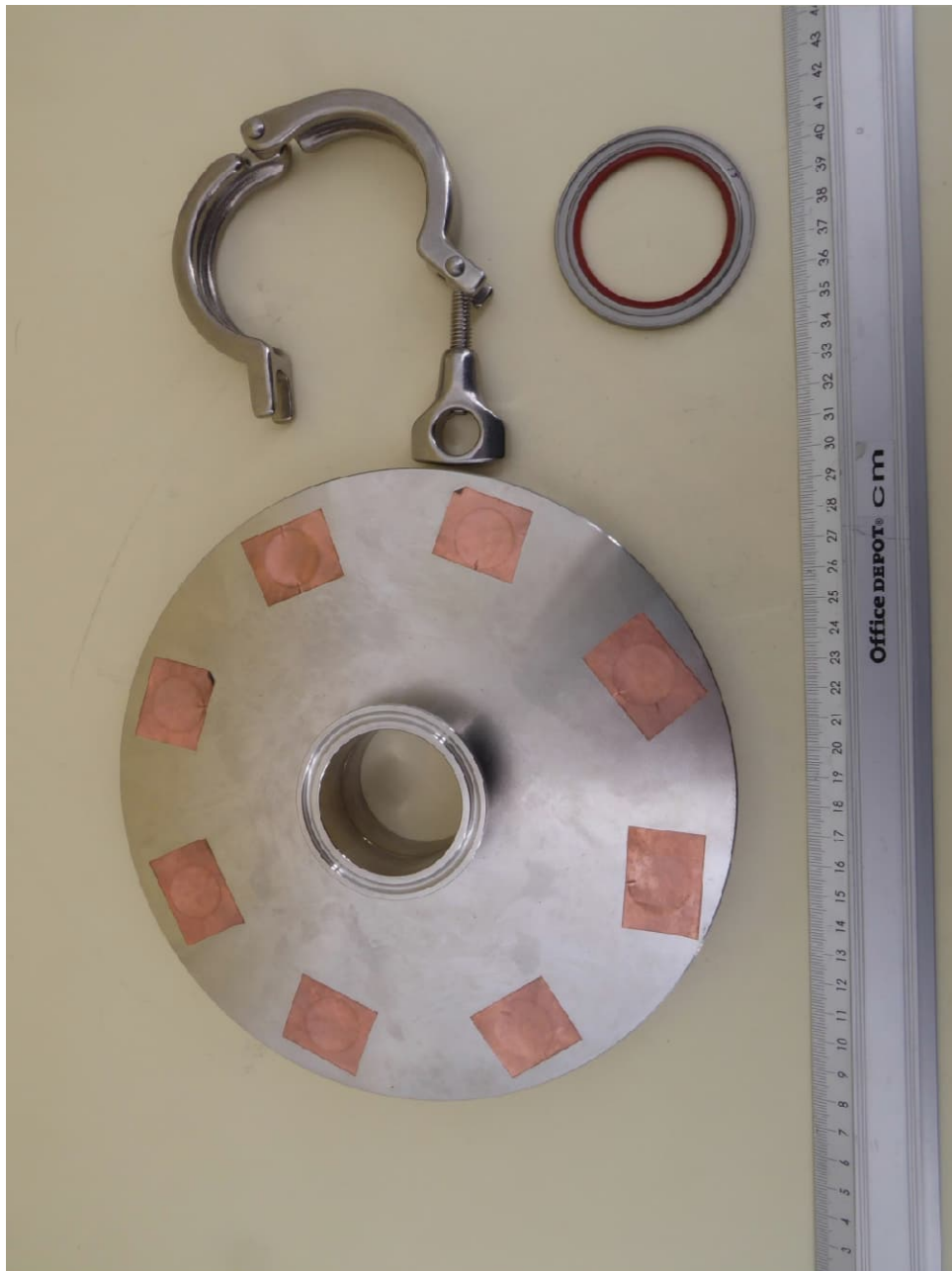
EUT 4, flange plate and mounting equipment