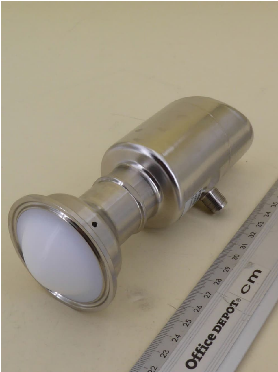
EUT 4, 3-D-view 2