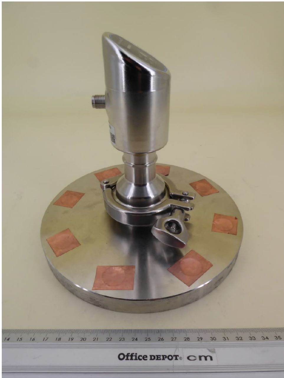
EUT 4, mounted on flange plate