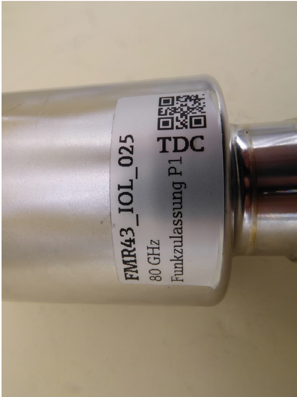
EUT 1, marking