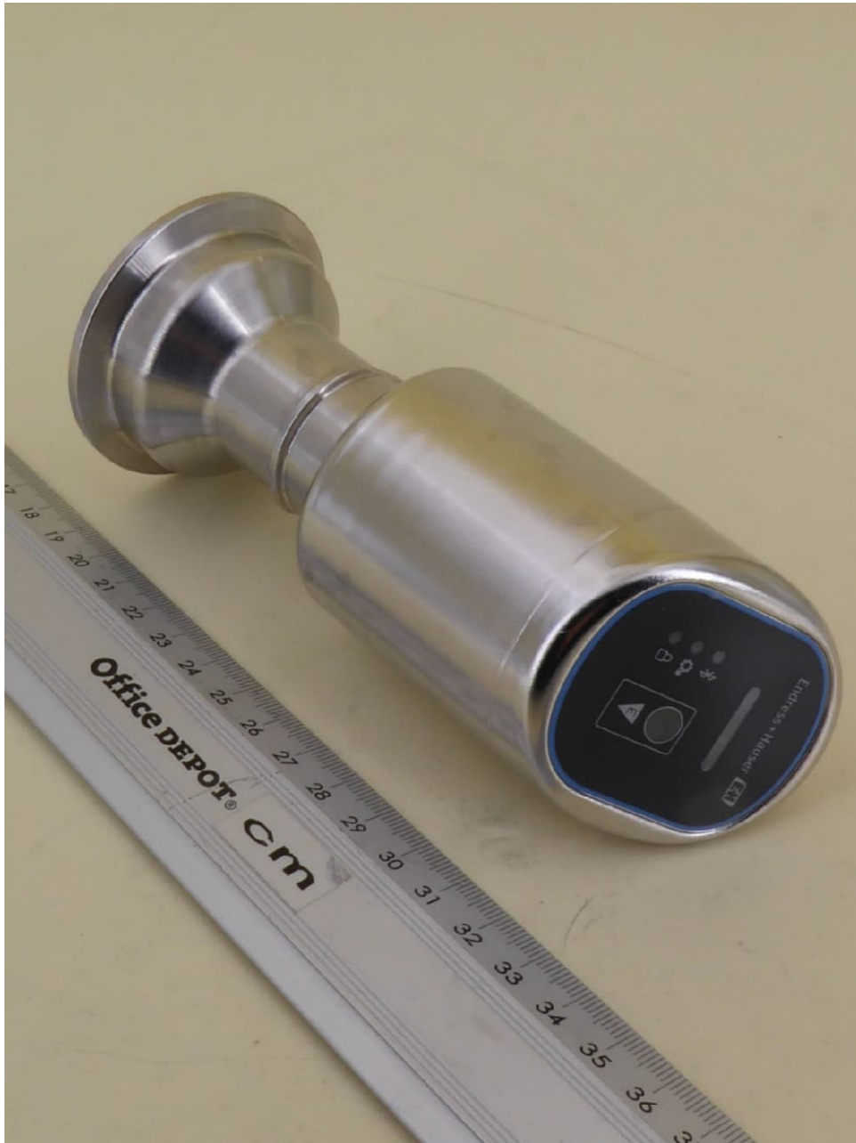
EUT 4, 3-D-view 1