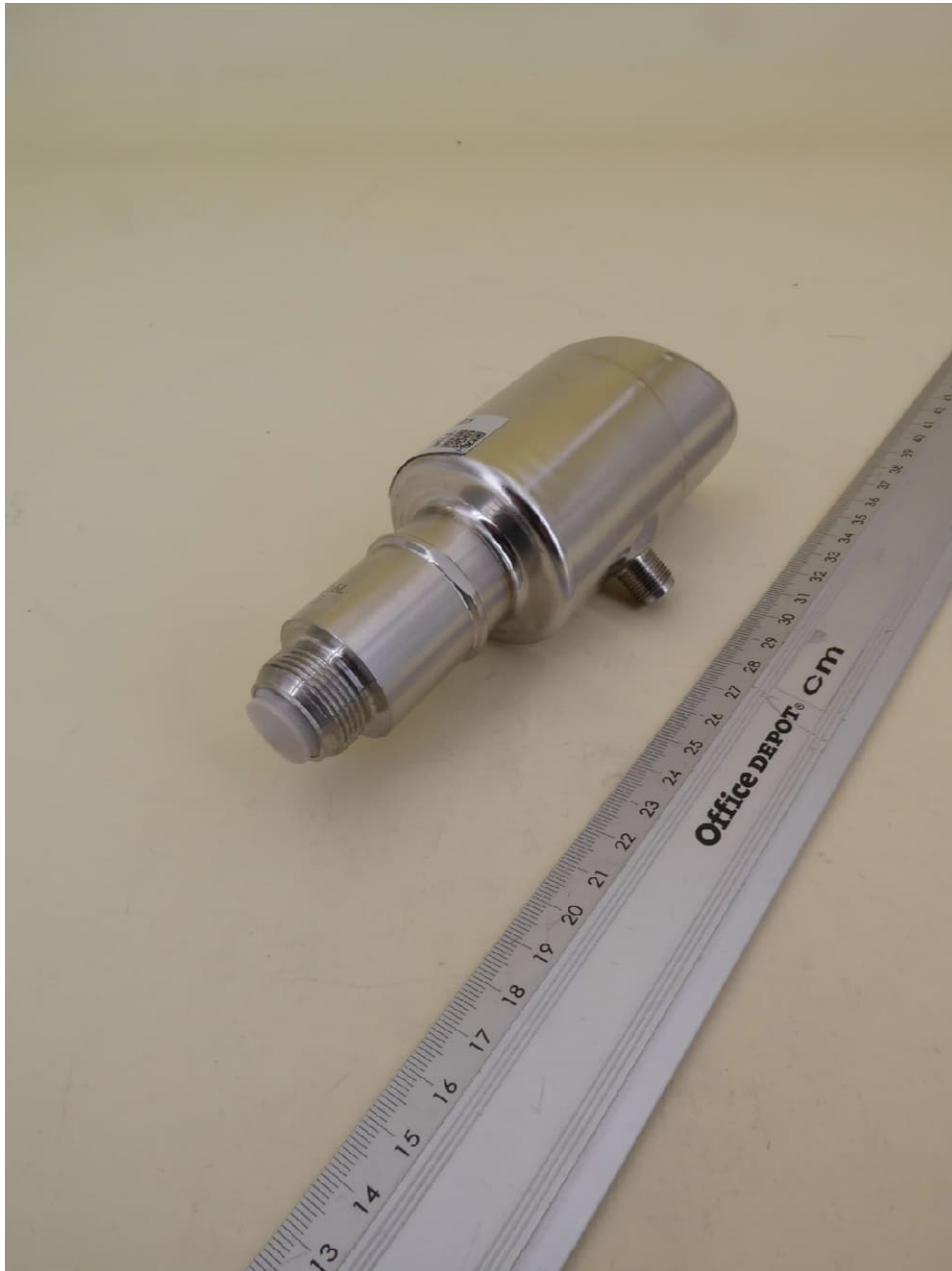
EUT 1, 3-D-view 2