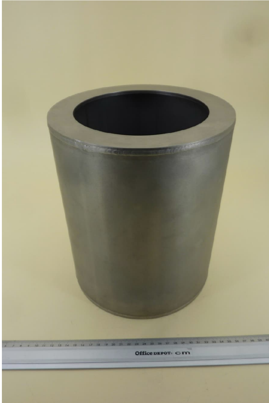
used tank, 3-D-view