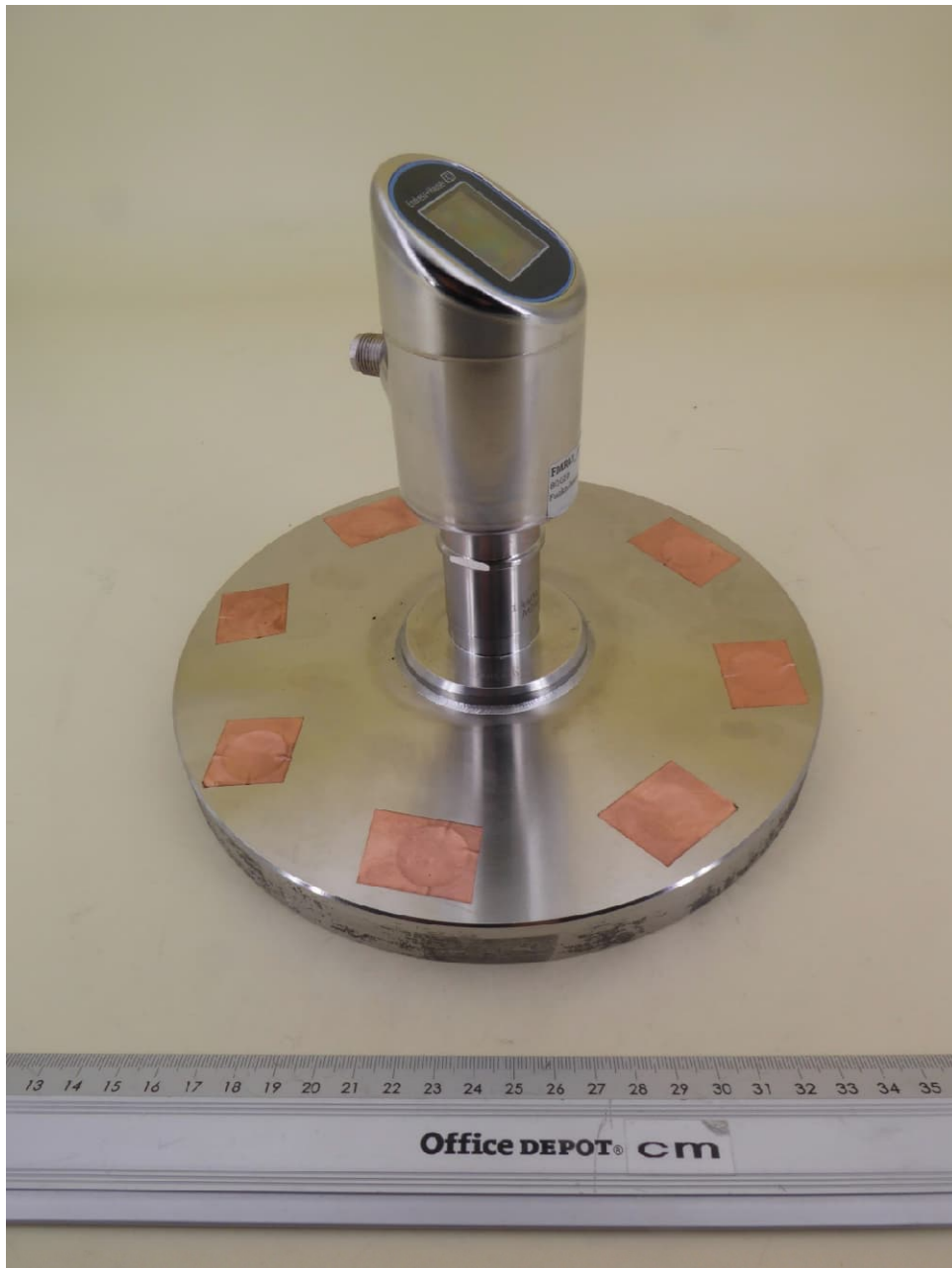
EUT 1, mounted on flange plate