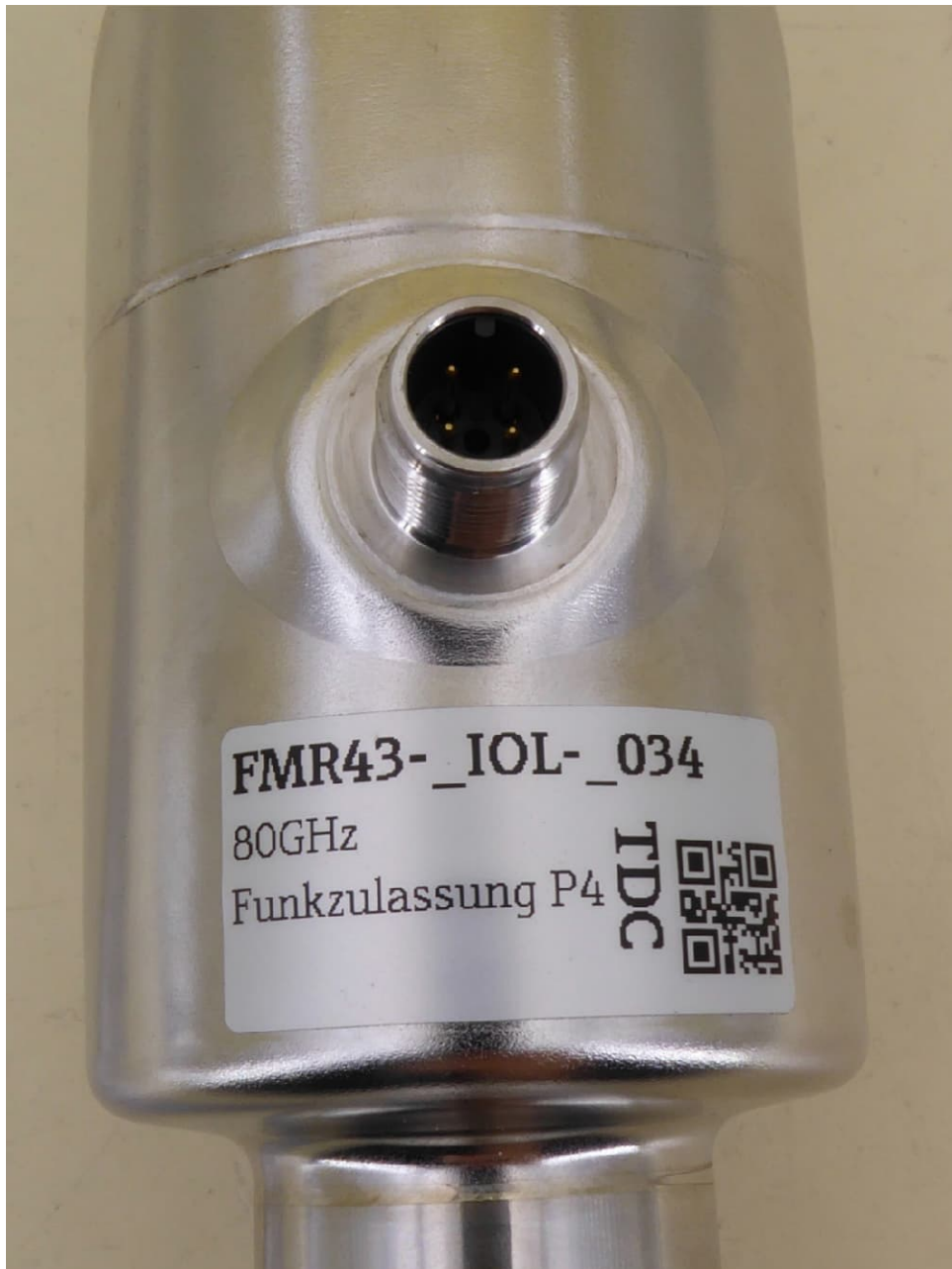
EUT 4, marking and connector view