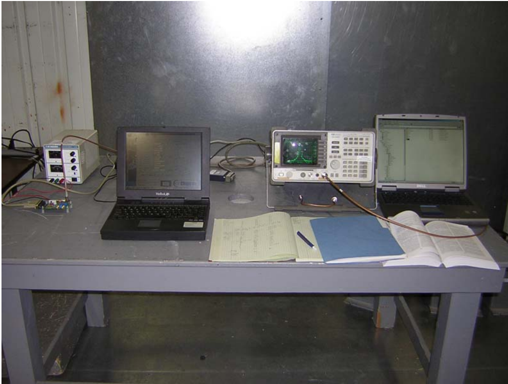
Antenna Port Conducted Emissions