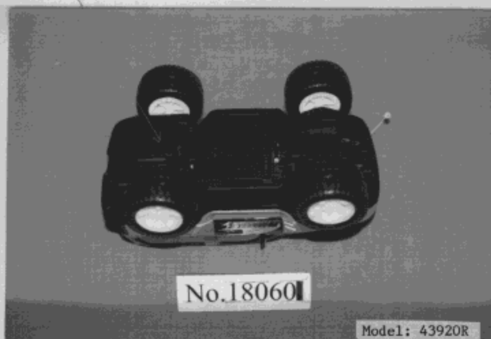
Photograph of the physical location of the label.

Labelling Requirements per 2.925 & 15.19 The label shown will be permanently affixed at a conspicuous location on the device.