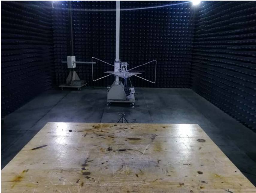
Photograph of set-up for Radiated Emission below 1GHz