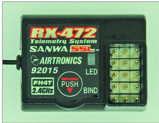
EUT- Bottom View