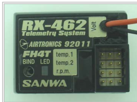
EUT- Bottom View