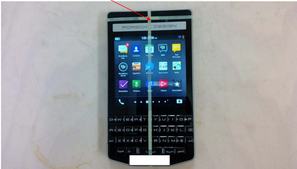
Figure C1. BlackBerry Smartphone