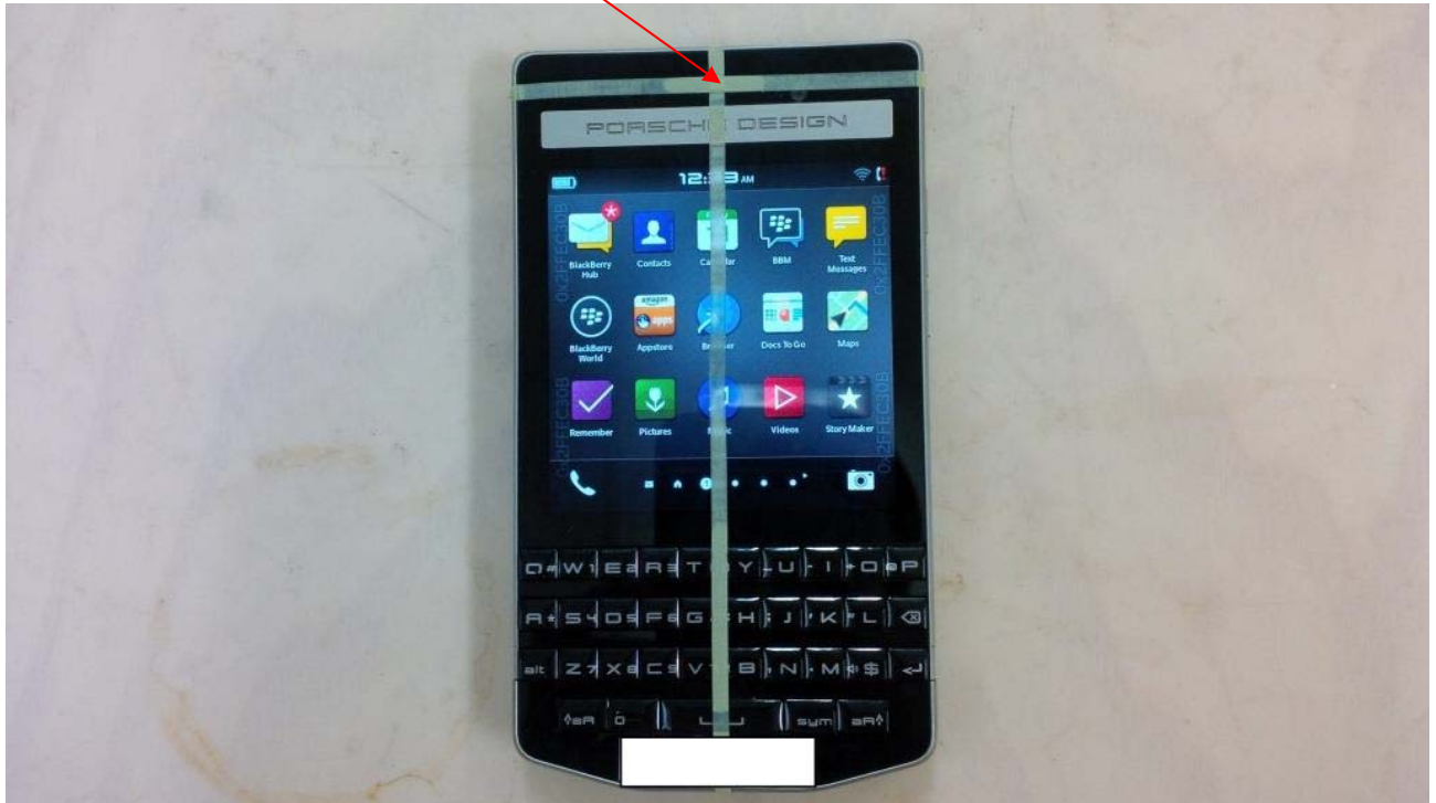
Figure C1. BlackBerry Smartphone